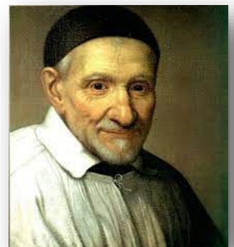
Feast Day: September 27