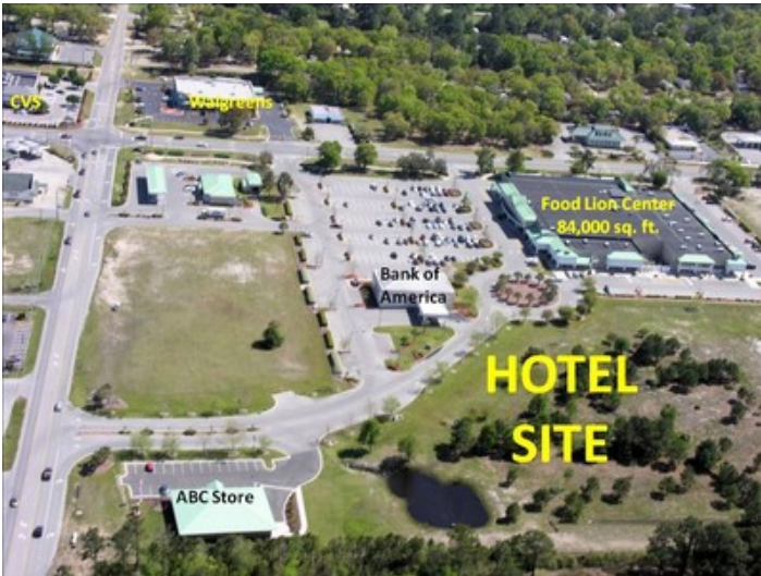
Site 1 Labeled