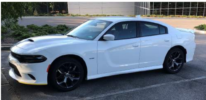
Appropriate Rental Car to visit the Barber Museum