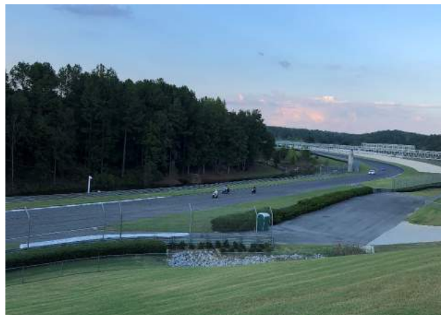
View of the Barber Race Track

First a little background on the museum. The Barber Museum is the largest motorcycle museum in the world with over 1,600 motorcycles and vintage racing cars. It was established in 1994 and moved to its current location in 2003. The 230,000 square foot building, consisting of five levels, is a work of art in its own right. It has an ultra-modern look to it but does a wonderful job of displaying vintage machines dating back as far as 1904 up to modern production and racing motorcycles. It is situated on the 880 acre Barber Motorsports Park that includes a world class 16 turn, 2.38 miles car & motorcycle road race track, a proving grounds and an off-road race course.