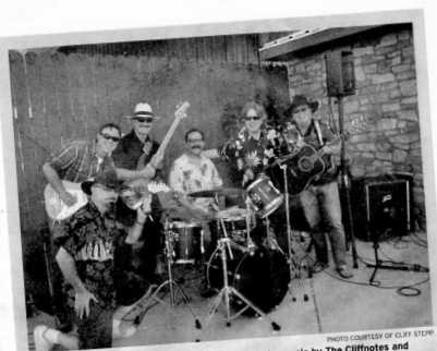
An "All American Picnic" including free chicken picnic, music by The Cliffnotes and dancing, will be held from 6 to 10 p.m. Saturday at Eagle Castle Winery, 3090 Anderson Road in Paso Robles. Tickets are $25 to $30. For reservations, call 227-1428.