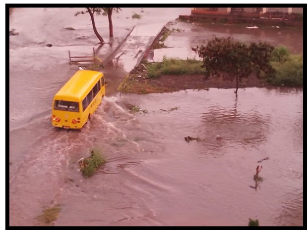
Front Campus under water.