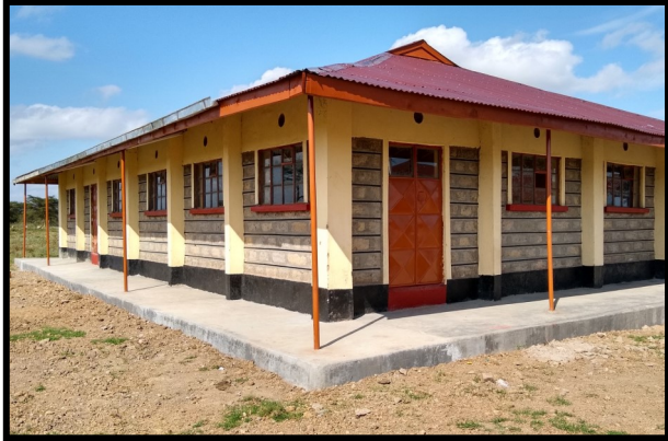
Thank God the Maasai girls' school stayed high and dry. The only problem was getting enough food into the school for the girls and the staff.