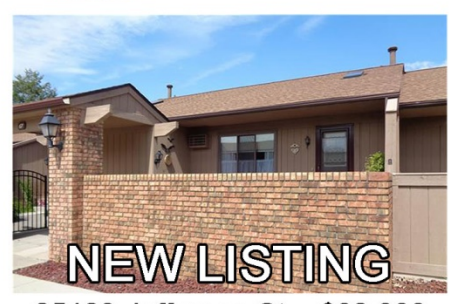
25123 Jefferson Ct. $82,000 55+ Condo Great location, 3 Bedrooms, 2 Full Baths, Kitchen w/ Skylights, All Appliances included. Walkout with Covered Patio overlooking Pond !!!!