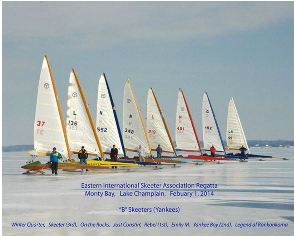
Eastern International Skeeter Association Regatta Monty Bay, Lake Champlain, February 1, 2014