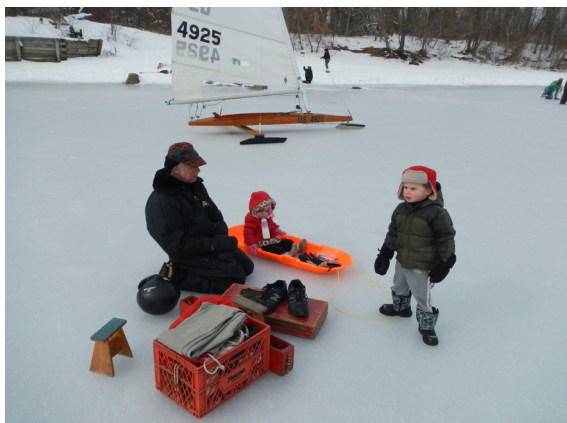
Fred Youth Training Session