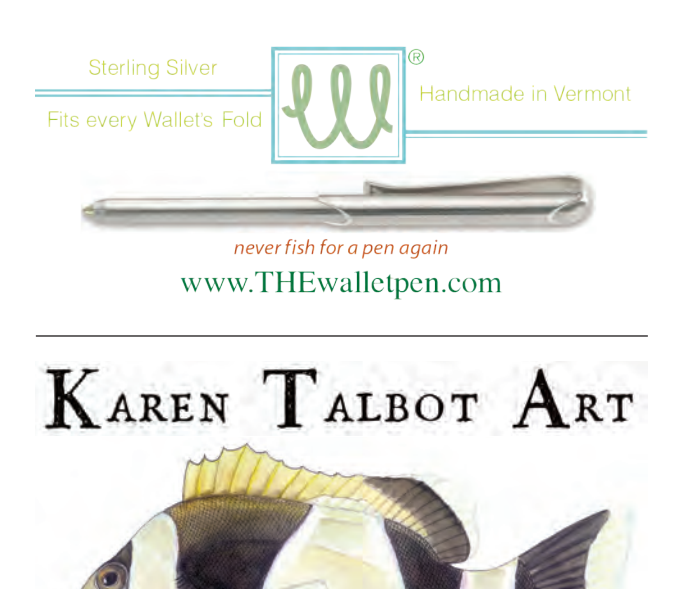
www.KarenTalbotArt.com Fine Art Scientific Illustration Commissions

With this knowledge under our belts, and as the reefs begin to rebound, Coral Reef CPR has initiated the next phase of the Holistic Approach to Reef Protection (HARP) program—the establishment of coral nurseries. Shifting away from the traditional approach used in the Maldives to grow corals, we are targeting the "super corals" that survived the bleaching event, as they are more resistant to higher temperatures and more likely to survive future El Niño events. Read more about our coral nurseries in the next issue.