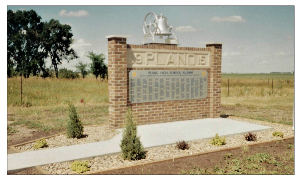
Pictured is the memorial erected in memory of the Plano School, which was six miles south of Mitchell in Plano Township.