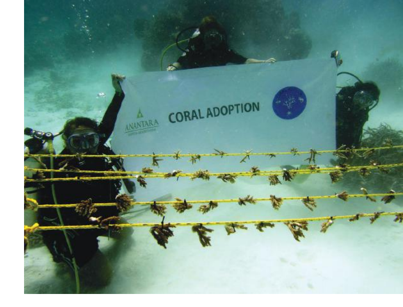
Support our conservation and rehabilitation efforts adopt a rope or table now! Visit coralreefcpr.org for more details to make a difference.

over 1,000 corals in five areas; 80 to 95 percent of them were still alive after three months, and new growth had already occurred. The main cause of mortality was predation by Drupella snails; some fragments had bleached and succumbed to disease. We attempt to place corals at the same depth from which they were collected, as transplantation of colonies from deep water to shallow nurseries inevitably results in bleaching.