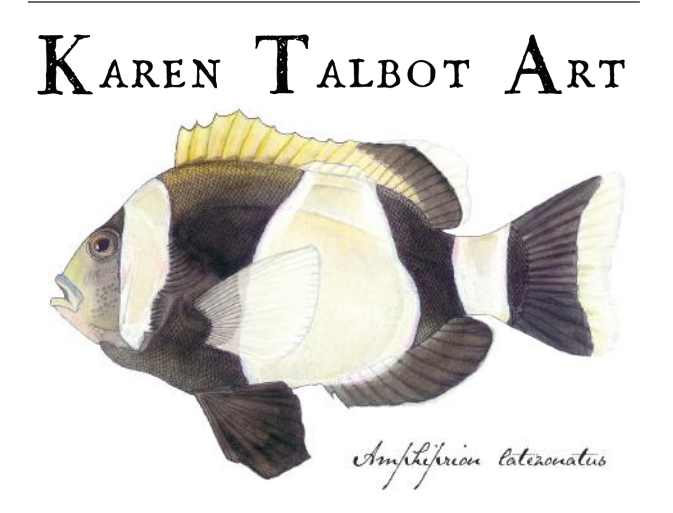
WWW.KARENTALBOTART.COM FINE ART SCIENTIFIC ILLUSTRATION COMMISSIONS