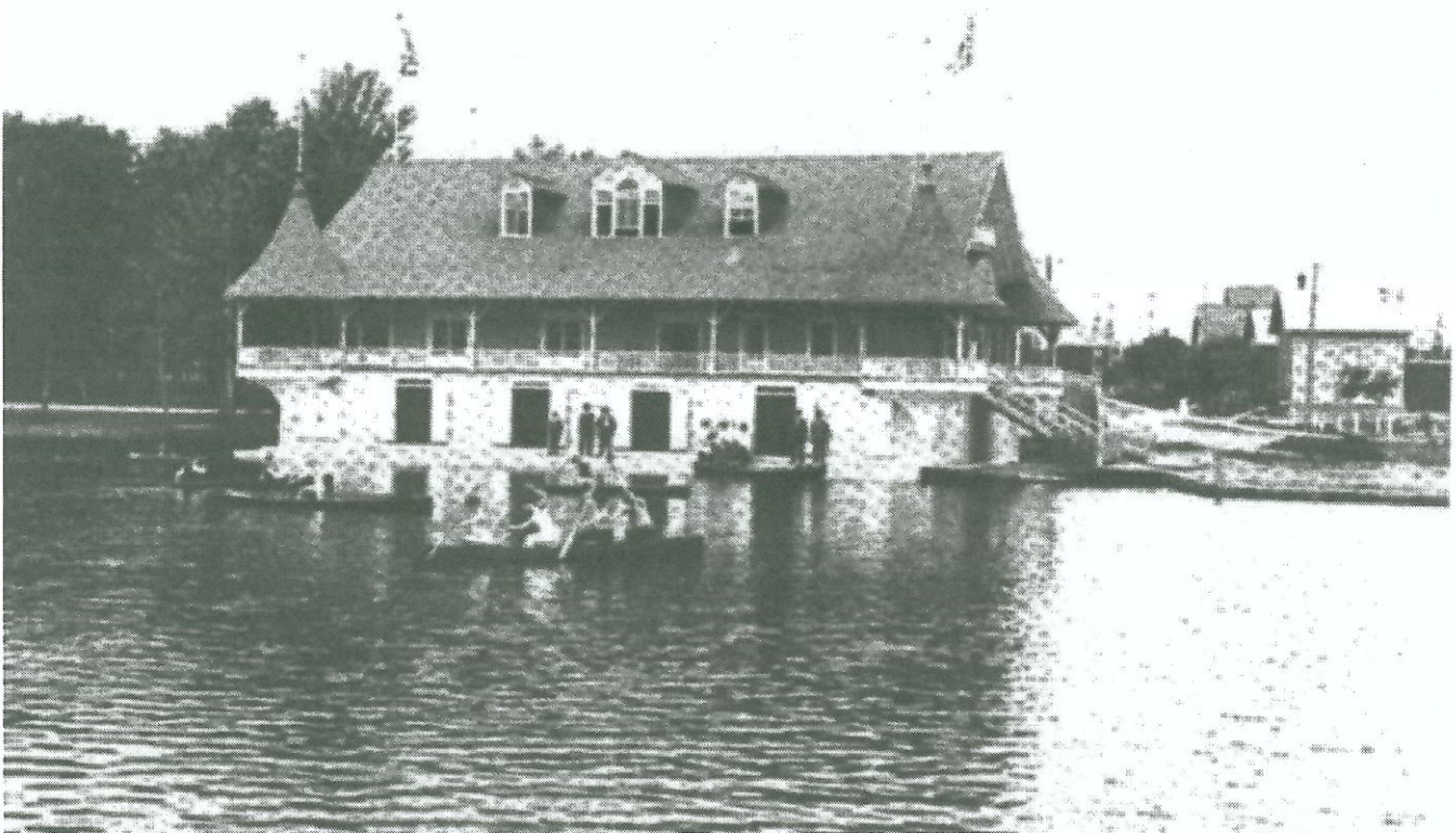
Dow's Lake Boathouse, circa 1905

With the waterworks completion, the usual bucket brigade method of supplement horse drawn water carriages changed into a more modern equivalent.