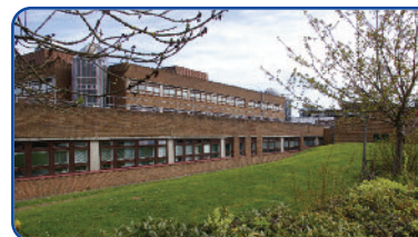
Site of the new Royal Surrey Urology Centre adjacent to St Luke's Cancer Centre

"I am very pleased that we are able to progress this project, which recognises the Trust's commitment to Urology services and in particular the treatment of prostate cancer.