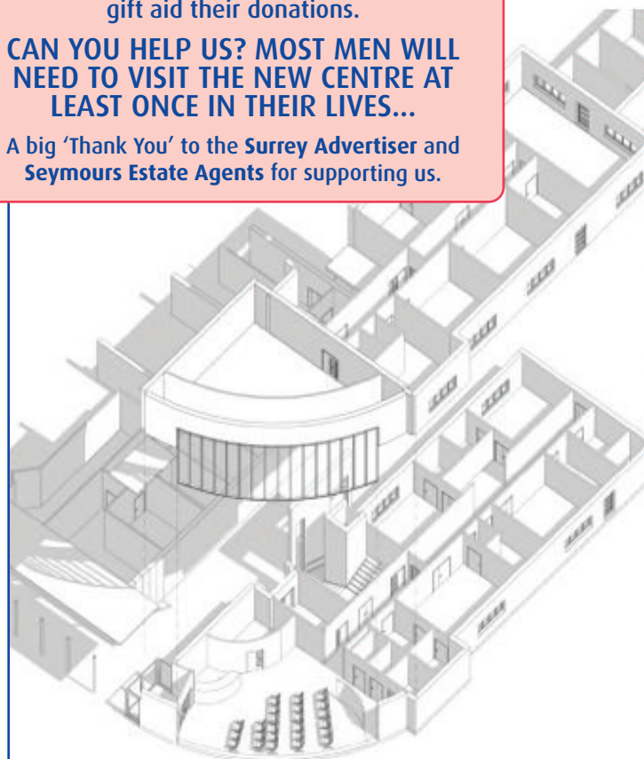
3D Axonometric of the new Centre

Now all that will change. The new Centre will enable consultants to host joint prostate cancer team meetings with their colleagues in the South West Surrey Region and to run joint collaborative clinics. It will be an essential step towards a one-stop shop for men with prostate cancer and all urology patients.