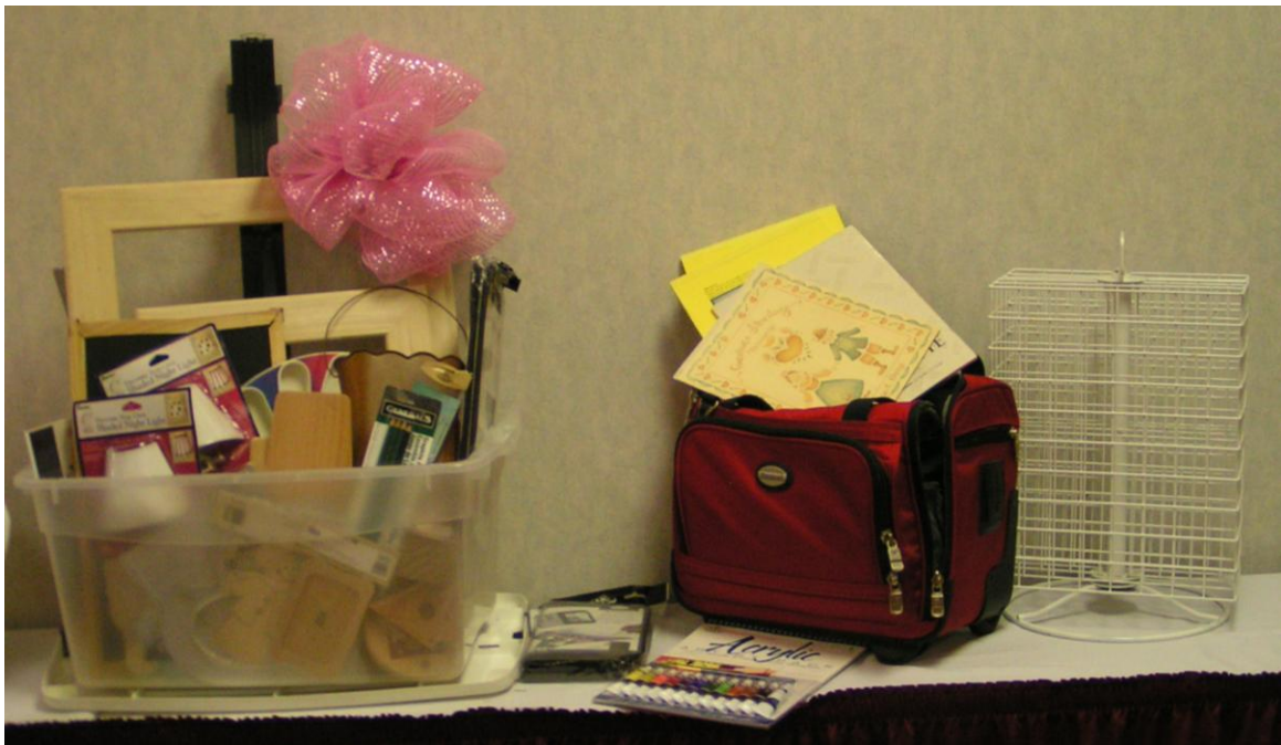
Rolling Cart Raffle