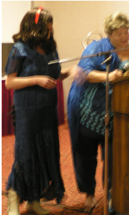
And a special 'guest star' you'll have to come to the November meeting to see who it was.