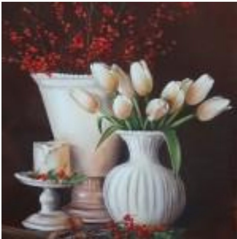
Saturday – White Tulips