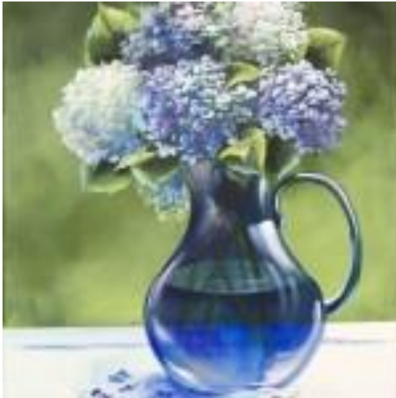
Friday – Cobalt and Hydrangeas