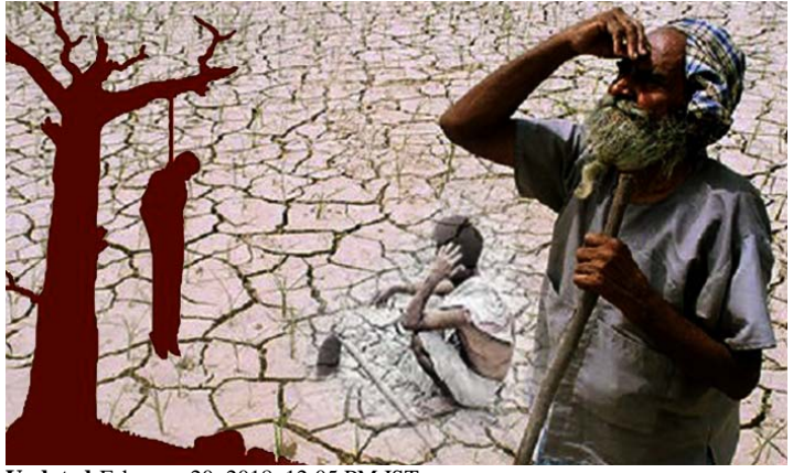
Updated:February 20, 2018, 12:05 PM IST