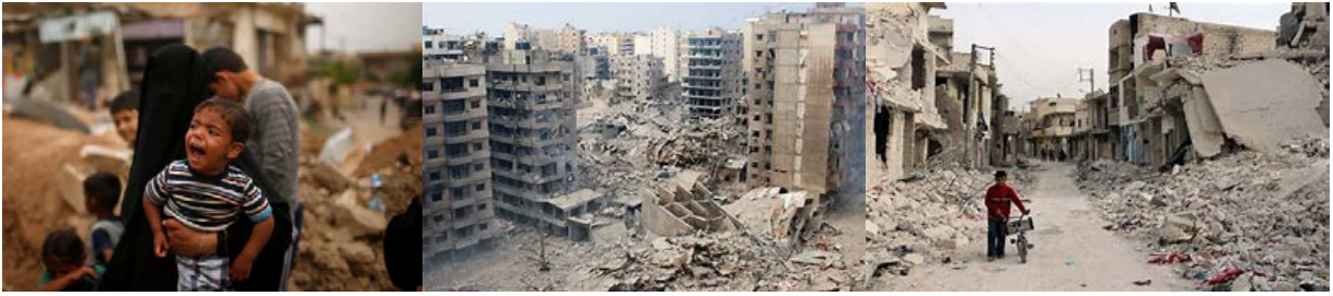
A boy cries as displaced Iraqis flee their homes in Mosul, Iraq in May 2017

Iraq, US, Iraq 2003 invasion, chemical weapons, war, US occupation of Iraq Wednesday 4 April 2018 21:46 UTC/Wednesday 11 April 2018 15:09 UTC