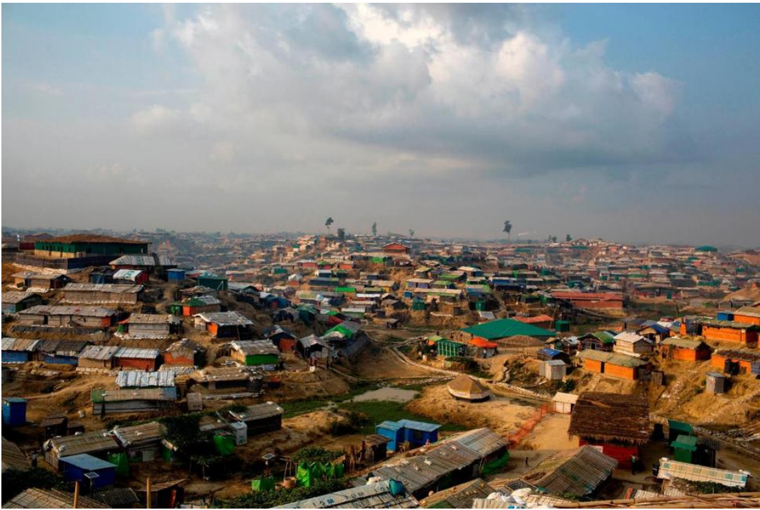
This April 30, 2018, photo shows a view of the Kutupalong Rohingya refugee camp in Kutupalong, Bangladesh. The Rohingya refugees who fled Myanmar amid a brutal military crackdown now face a new danger: Rain. The annual monsoons will soon sweep through camps where some 700,000 Rohingya Muslims live in huts made of bamboo and plastic built along steep hills. (AP Photo/A.M. Ahad) THE ASSOCIATED PRESS BY JULHAS ALAM, Associated Press