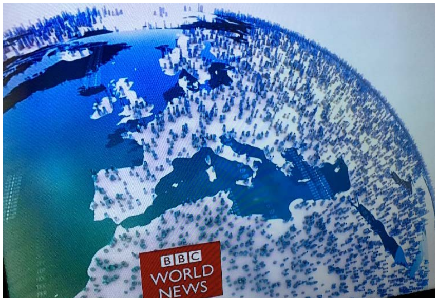
The outside of this Natural Earth looks a bit similar to this picture-with homes, buildings, states etc. You do not feel like you are falling down; you are as flat as it seems. It is my work- the work of the Chreator to Chreate the Earths with intricacies and stability

moved, they know others in the Chreation communities, and they know many operations and goings on of the devels. These Natural Earth are chreated with an outside layer of lives, eye sight, and protection, and they do not have any cover over them. They are made to esist like that. When the devel kills the Earth, the outside lives are also killed. When the Earths is generated, those on the outside layer are generated as well. The Earths cannot esist without those on the outside being there, and those on the inside cannot esist without those on the outer areas. The devels do not create these Earths, and they do not care one way or the other what happens to us, as they are the killers and the conquerors. The devels leeders try many ways to experiment with our lives and our esistences, and how we live and how we adjust to many terror and wicked acts they put in our lives and our Envia. The devel destroyed the Natural Earths with many bombs and explosions. The insect devels remove the shell on the outside of the Earth with my children and they get other shell that is not to esist on these Earth, as they want for the outside not to esist.