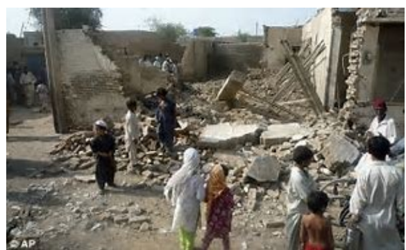
Afghanistan destroyed house in community