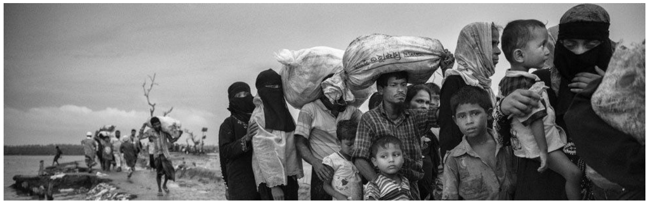
The plight of hundreds of thousands of Rohingya people is said to be the world's fastest growing refugee crisis.