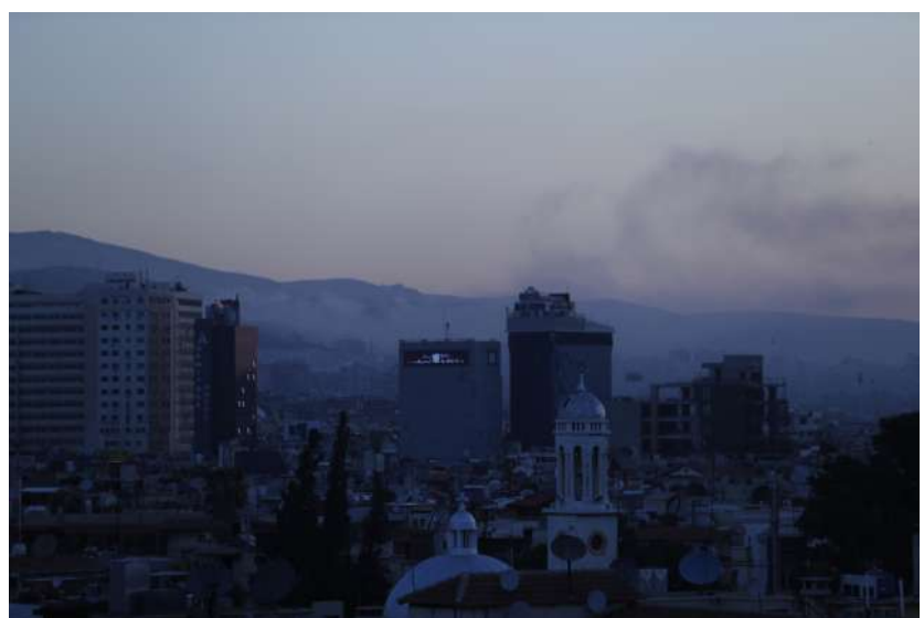
Smoke rises after airstrikes targeting different parts of the Syrian capital Damascus, Syria, early Saturday, April 14, 2018.

US, France, Britain launch strikes on Syria 16 April, 2018 12:00 AM