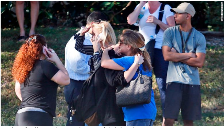
Anxious family members await news of their loved ones