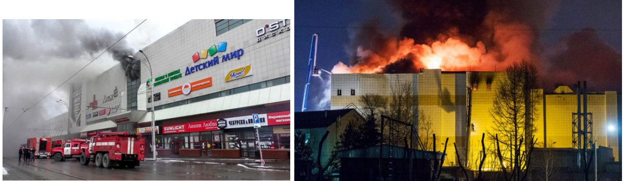
A blazing fire broke out in a shopping centre in Russia, leaving at least 56 dead with many more still missing.

MOSCOW — With anger, sadness, and confusion, Russians struggled to come to grips Monday with a shocking failure of fire safety that allowed a blaze to storm through a crowded shopping center in the Siberian city of Kemerovo, killing 64 people on March 26, 2018. An entire class of schoolchildren apparently died in Sunday's fire, some having had the chance to make desperate, futile phone calls to parents or relatives before succumbing to the smoke and flames.