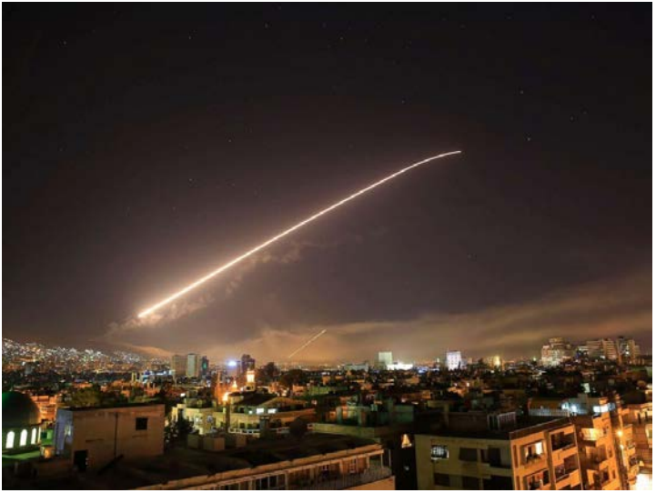
April 14, 2018

United States, France, & Britain Launch Military Strikes in Syria in Response to Chemical Attack