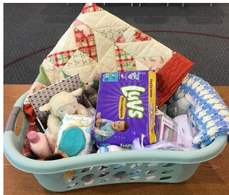
Picture of Circle 2 Christmas Baby Basket