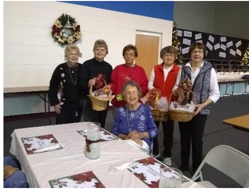
Picture of Members of Circle 5 with Baskets for Shut-ins