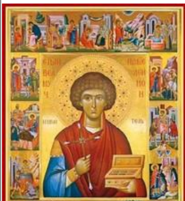
Gr. Martyr and Healer St. Panteleimon