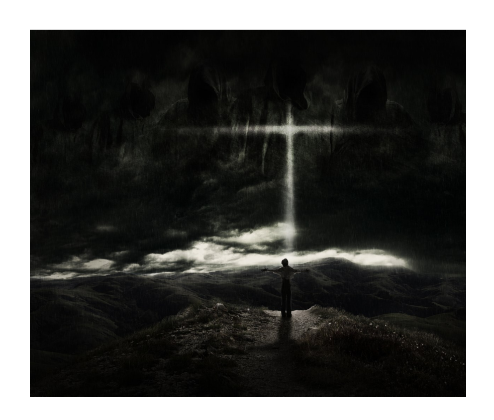
April 17, 2019 Holy Wednesday Healing Service 7:00 PM