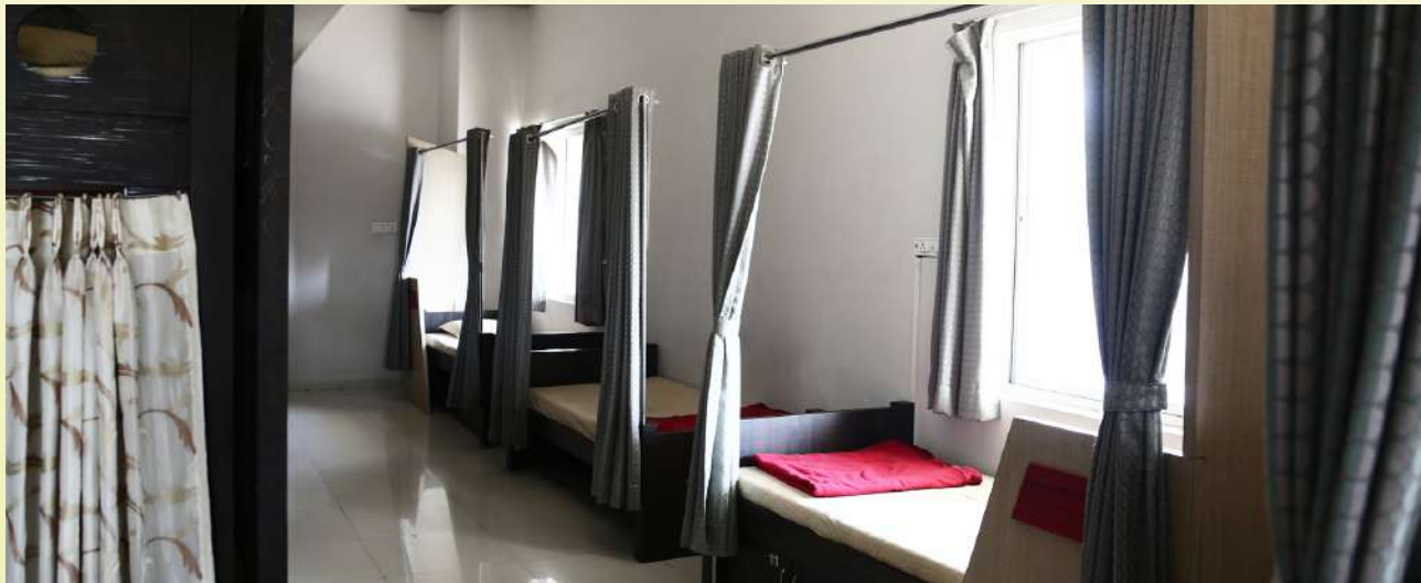
100 Beded Delux Room - IPD Facilities