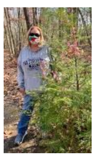
Enjoy the warming weather! Beth