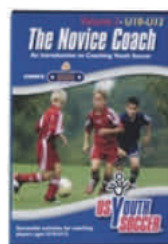
US Youth Soccer The Novice Coach Vol 2-Under 10-12 years $3.99

These may be found on the USYS online store— here