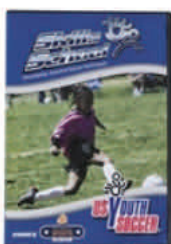
US Youth Soccer Skills School $3.99

USYS can provide you with tools to help you coach your team, at a very modest cost? The following items are examples of what the USYS, online store has to offer: