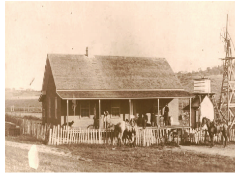
Original Chimineas Adobe, circa 1880

Some of the grateful recipients of your Life Membership gift.