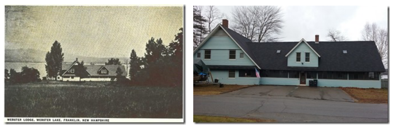
Individual response and reminisces about the Lodge can be viewed on the Society's FB page.

The new year will most certainly offer new challenges, but also new opportunities. If there is one new year's resolution to be made, it might be for each member to help swell the Society's ranks with more new, young, passionate, and motivated members to assist in carrying on the message that remembering history and its lessons, is vital to a better future.