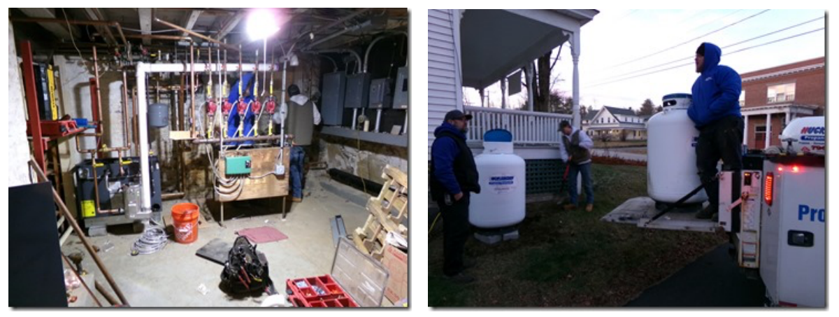
The necessity to place the propane tanks outside and accessible to the boiler, is being viewed by Easterseals and the NH Preservation Alliance as a temporary situation, for a more suitable location to be discussed in the spring when burying, and therefor concealing, a larger single tank may be more in keeping with the outside appearance of the Society's historic building, and that of the entire campus. Huckleberry Propane of Boscawen performed the installation at a reasonable cost, with professionalism and attention to detail.

January is a month in which little usually happens at the Society, but December was noteworthy for several items. A new propane-fueled boiler to heat the building was installed mid-month, to make the Society independent of the campus heating plant, soon to be dismantled to accommodate a repurposed use of the space by Easterseals.