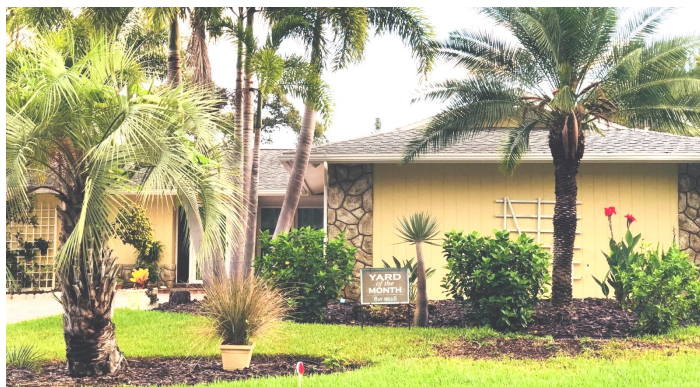
July Yard of the Month on Tanglewood

We are getting PLENTY of rain at this time of year so you can turn off your sprinklers. Overwatering just increases your bill and encourages fungus growth. Need help with lawn damage? There are a number of spraying services available in our area and not all require contracts. NOTE: parking on yards damages grass & sprinkler heads as well as detracting from the normally beautiful appeal of Bay Hills. THANKS FOR YOUR COOPERATION!