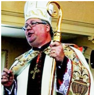
Rt. Rev. Anthony Mikovsky prime bishop of the Polish National Catholic Church.

Originally, the church was independent, but in 1930, the congregation opted to merge with the Polish National Catholic Church (PNCC), a democratic, non-papal denomination with headquarters in Scranton, Pa.