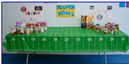
Souper Bowl donations

to Operation Shoebox; these items will go into care packages and be sent to active duty troops overseas who are protecting our country.