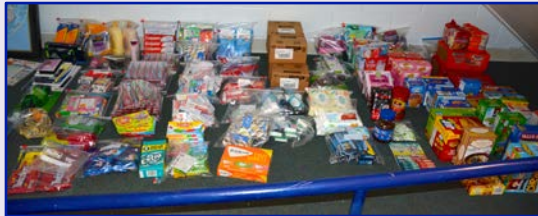
Operation Shoebox donations

Thank you to all who donated food items for the Souper Bowl, which will go to the SMILE Food Pantry. We are also grateful for all the donations