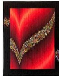
*Two Color Bargello Quilt Class - Sat., Jan. 30th (9am—3pm)