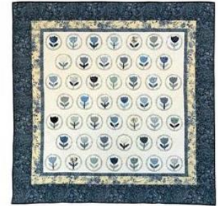
*A beautiful Spring quilt project called "Ederveen" – pattern from book called Somewhat In the Middle.

Visit us online: www.ppnq.com Contact us: ppnqstaff@ppnq.com or 281-471-5735