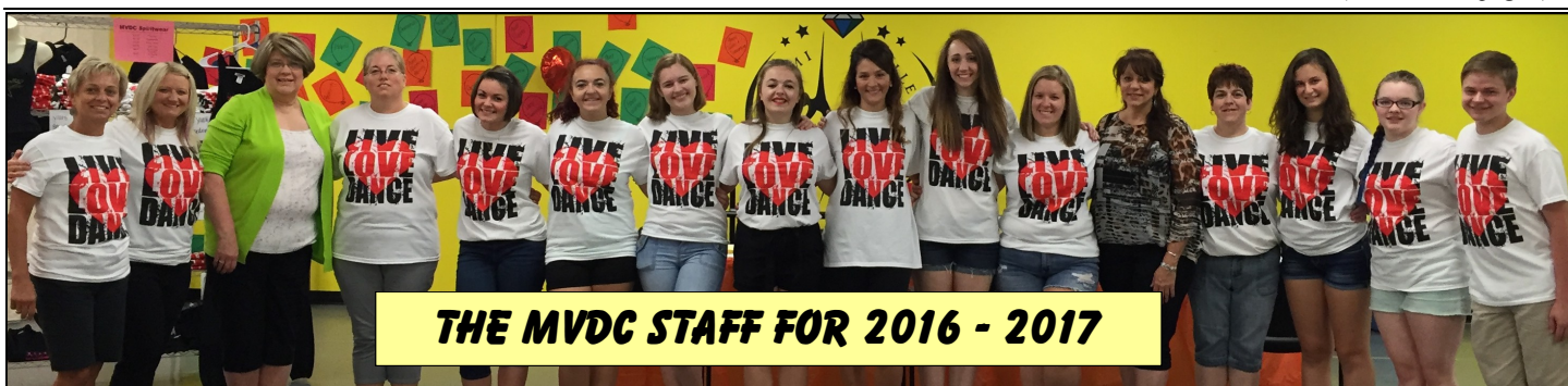
THE MVDC STAFF FOR 2016 - 2017