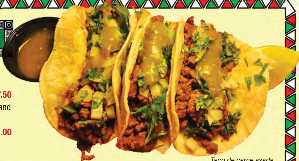
Taco de carne asada

Flour tortilla with your choice of spiced chicken or beef tips, deep fried to a golden brown, topped with cheese sauce, lettuce, pico de gallo, and sour cream, served with Mexican rice and beans