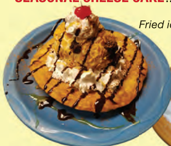
Fried ice cream