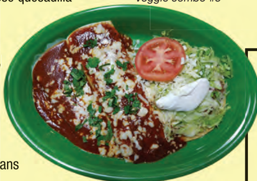
Veggie combo #3