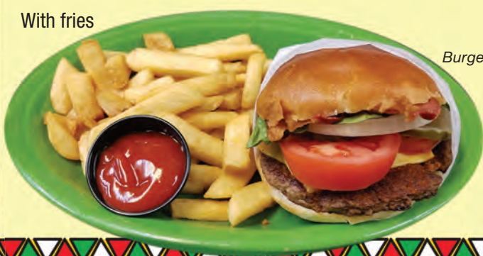
Burger and fries