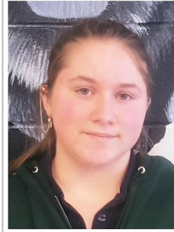
Talented Art Show at the Albany-Springfield Library.