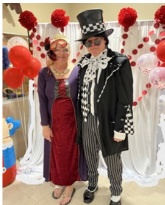
Kena Fools Ball on Apr 1; Manassas, VA