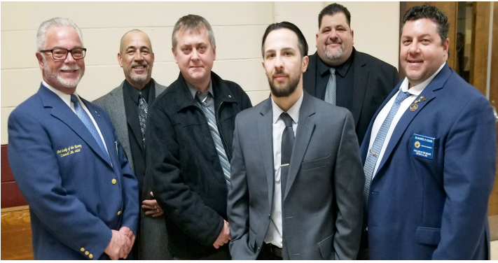
OLOR Brothers who took their Knighthood 3rd Degree at Mother Cabrini Council in Coram