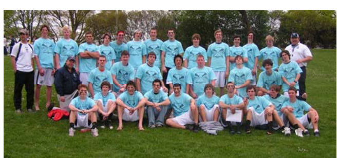
The Hill School, Boys Lacrosse Team 2009