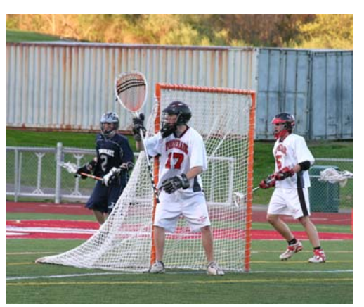
AAF Boys Recipient