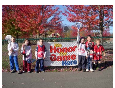
Pomperaug Youth Lacrosse - The Future

We look ahead now to June 27, 2009 as the date of the AAF Braveheart Showcase Tournament. This event will take place at the PHS Sports Complex and adjoining fields.