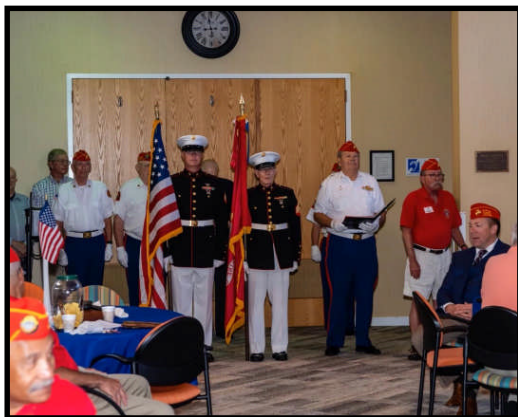
Marine Veterans Color Guard about to Present the Colors.