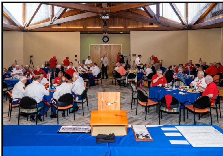
Our first meeting at our new location: Lakewood.

Breakfast 0800 to 0850 and meeting starting promptly at 0900. I would like the meeting to be concluded by 1015 at the latest so the Military Order or the Devil Dogs can start their meeting soon after. Woof Woof!