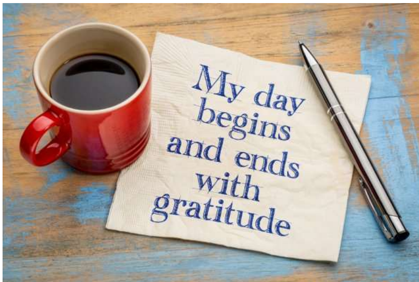
March's Gratitude Image