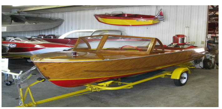
Billy's Boats at the Lake July 4 & 5, 2014 from 9:30 AM to 5:00 PM

Our own Billy Anderson has invited all to an open house at his building just west of the Gables. This shop/showroom accommodates over 30 of some of the most unusual and unique boats assembled anywhere! This is a display you don't want to miss, so invite your friends and family to see this one of a kind display.