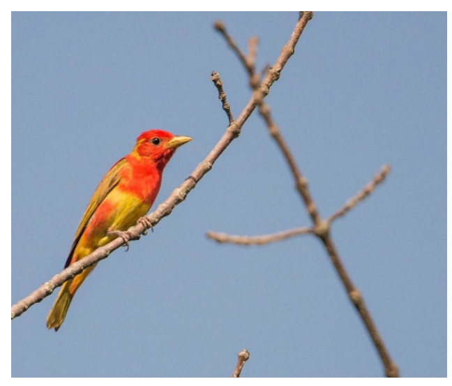
This is a first year male summer tanager. as an adult, he will turn all red. The Summer Tanager migrates as far as the middle of South America each winter. They will depart our area by early Autumn. They eat bees and wasps, catching them on their wings to avoid getting stung.