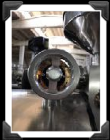
ALL NEW MDDS AIRFLOW

BUCKEYECOFFEE.COM 623.332.1360 INFO@BUCKEYECOFFEE.COM