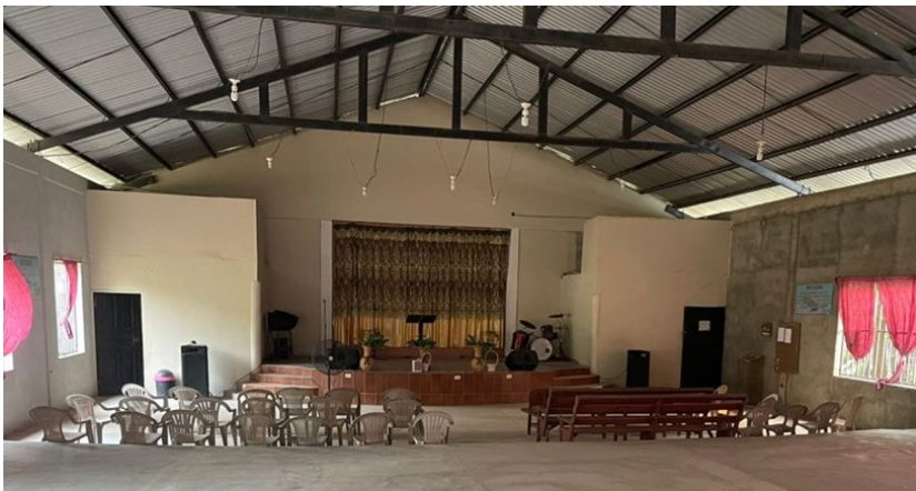
Church in LaJutosa