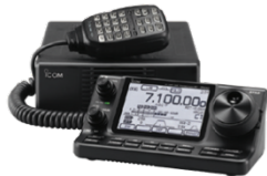
IC-7100 All Mode Transceiver