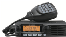
TM-281A 2 Mtr Mobile