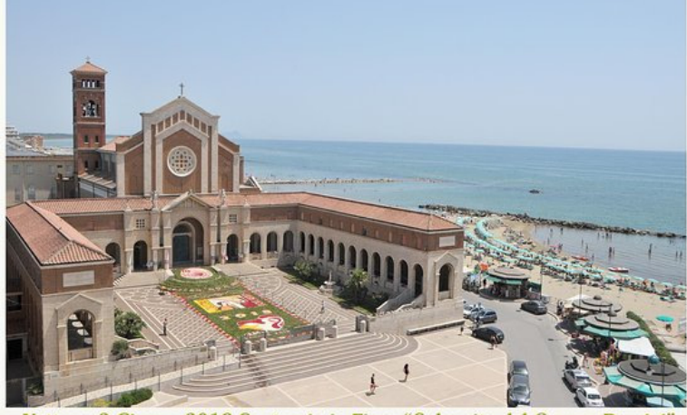
Nettuno 3 Giugno 2018 Santuario in Fiore "Solennita del Corpus De

Today, once again we will venture outside of Rome to the city of Nettuno along the Tyreman Coast to visit the