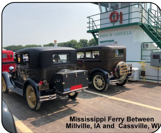
Mississippi Ferry Between Millville, IA and Cassville, WI