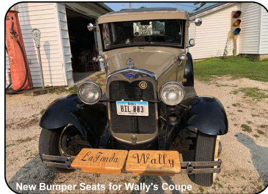
New Bumper Seats for Wally's Coupe