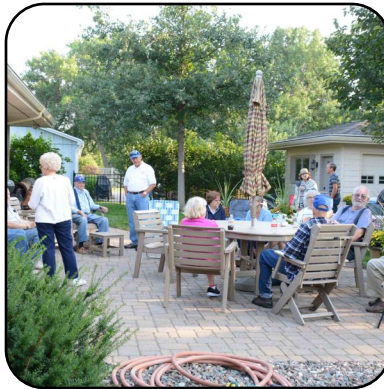
Catching up on everyone's summer