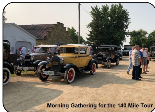
Morning Gathering for the 140 Mile Tour