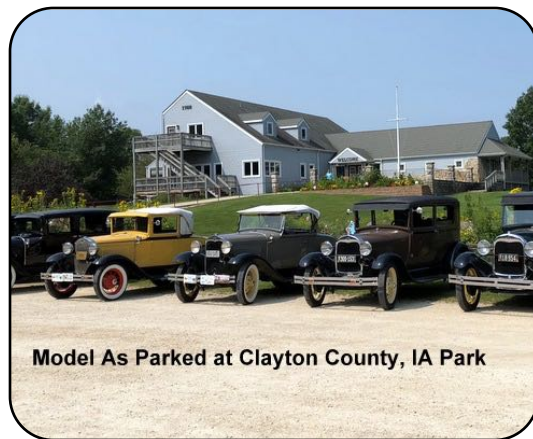
Model As Parked at Clayton County, IA Park