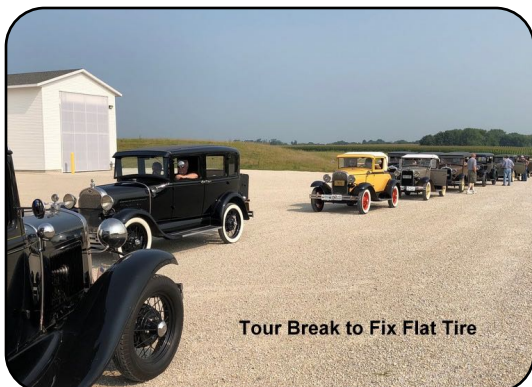
Tour Break to Fix Flat Tire