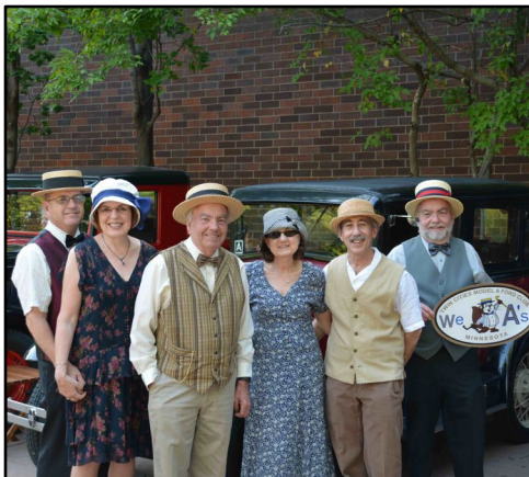
Eight Model A's were on display

A beautiful warm summer night where we enjoyed the annual concert put on by the John Philip Sousa Band featuring patriotic marching band songs from a bygone era at the Edina Centennial Lake property.