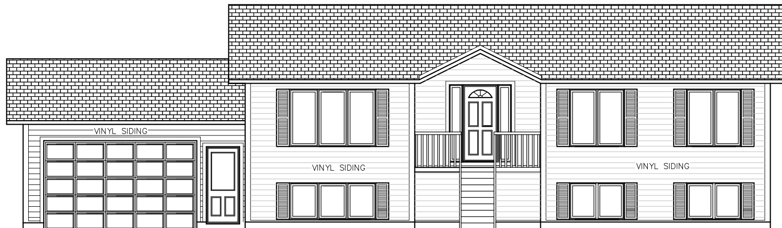
Front Elevation "A"