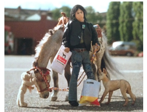
Scenes: Photo Formats Other Than Digital & 35mm (6): 1-LBR Tjorben: Shop-