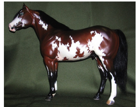
CHAMPION STOCK BREED: CRUSHER JOE (AC)

Other Pure or Mixed Stock Breed (7): 1-Strange Meadowlark (AC), 2-Buckthorn (SM), 3-Tug Hill Pokey Dott (CM), 4-LBR Natoka (JG), 5-LBR Calgary (JG), 6-Big Blu (APa), 7-DO Dun IV (JV)