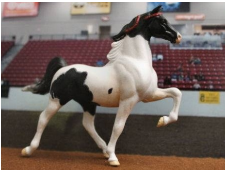
RESERVE CHAMPION GAITED BREED: OINGO BOINGO (HC)

Clydesdale/Shire (17): 1-RAS Elian Demoiselle (CM), 2-RM Nuclear Winter (KW), 3-Deloyer Starblazer (AC), 4-PR Burning Blue Soul (JV), 5-Amazing Heart (SN), 6-KT Cracklin' Rosie (AC), 7-Rumneyhill Victoria (SN), 8-TS Annie Red (MP), 9-WG Kenny (HC), 10-CS Dark Lord (APo)