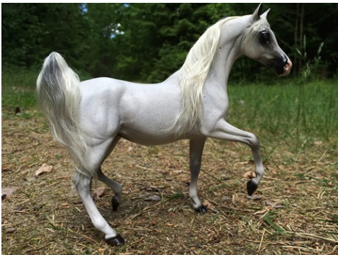
CHAMPION GREY/ROAN: SHANYA (SN)

Roan (25): 1-DQ Twilyte Image (SSt), 2-Cyberlena San (JG), 3-Justy (AC), 4-Banned From Argo (AC), 5-Blue Gale Bars (AC), 6-Go Varian (AC), 7-The Mad Cookie (CV), 8-Marine Snow (CV), 9-Rhapsody Redford (LB), 10-Simmerl (SN)