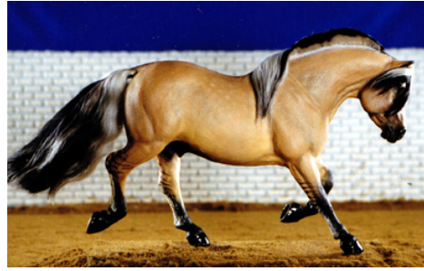
Ragnarok Hyoga , dun Fjord stallion, CM by Julie Froelich in 1992: