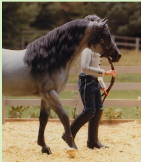
Justy 35 Years Old!