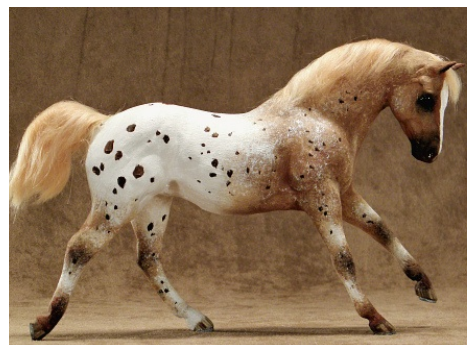
RESERVE CHAMPION PONY/MINI HORSE: DIAMOND PLAYTIME (CM)