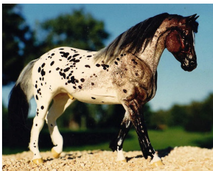
Freudian Slip , bay semi-leopard spotted Pinzgauer-Noriker gelding, CM by Judy Renee Pope in 1987: