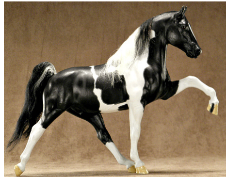
CHAMPION GAITED BREED: THE MIDNIGHT FLASHER MB (CM)

Other Pure or Mixed Gaited Breed (6): 1-AMB Midnight Frosty (AC), 2-Wicked Speedia (AC), 3-Flashdancer (AC), 4-Mr. Majestic (SSt), 5-Quaint Keaton (AC), 6-Wings Of Magic (AC)