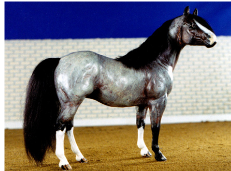
RES. CHAMPION SIMPLE REMAKE/REPAINT/HAIR OR SCULPTED MANE/TAIL: GO VARIAN (AC)

Major Remake & Repaint w/Hair M/T: Trad. or Larger (87): 1-Jamil Mhuratt (CR), 2-Tetsugyu (AC), 3-Angel Queen (CV), 4-Far Stars Burn (AC), 5-Areka Rattler (JV), 6-RM Jahil (AC), 7-KT Draublakken (JG), 8-Thunder In Paradise (AC), 9-Antara RM Sirdar (AC), 10-Matsuko DX (CV), HM-RM Heiwa (AC)