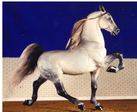
RES. CHAMPION GAITED BREED: FLIRTATION DEVICE (AC)

Clydesdale/Shire (13): 1-Thunder In Paradise (AC), 2-Brigante (AC), 3-Two Ton Tessie (AC), 4-Megazone Eve (AC), 5-Diamond Blue Rose (CR), 6-Royal Witch (APo), 7-Deloyer Clarion (CV), 8-Northrigg Sable (VM), 9-Belle (HC), 10-Castlekeep Mistress (LB)