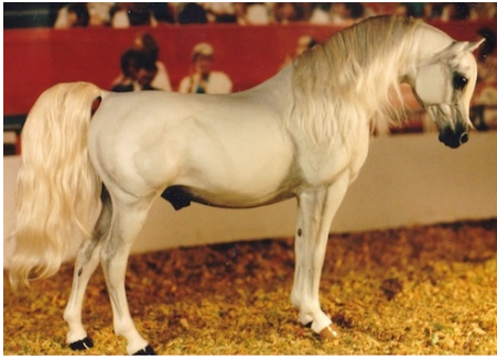
RM Pravda , grey Arabian stallion, CM by Julie Froelich in 1990: Spring 2017, Summer 2019