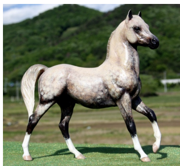
Sasaki , grey Arabian stallion, CM by Nancy Strowger in 1977: Spring 2020