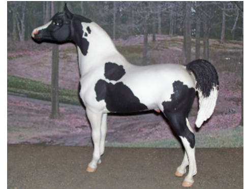
CHAMPION PATTERNED COLOR: TEJAS TREASURE (VM)

Other Pinto Pattern (9): 1-Tejas Treasure (VM), 2-The Pied Viper (AC), 3-Melulu (CV), 4-Polaris (SSt), 5-Flashover (SSt), 6-Singing Grass (CV), 7-Pick Me A Winner (APa), 8-Baricza (APo), 9-Love Gun (APo)