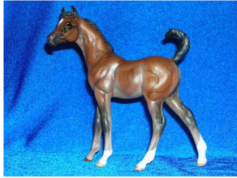
RESERVE CHAMPION FOAL: SOLANA (CV)

1990s BREED DIVISION OVERALL CHAMPION: AMANTUS VS (SN)