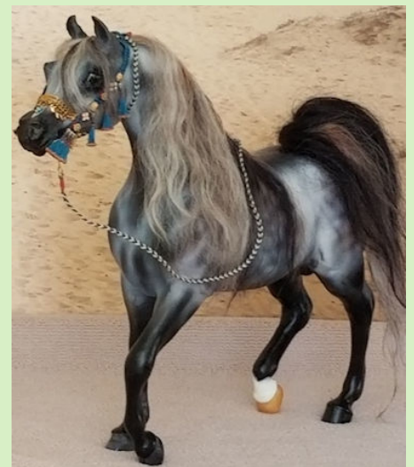
Ethereal Has Kavar 30 Years Old!