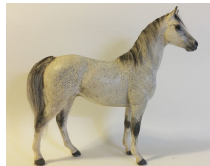
RES. CHAMPION REPAINT/HAIR OR SCULPTED M/T: FROSTFANG (KW)

Simple Remake & Repaint w/Hair M/T: Trad. or Larger (5): 1-Diamond Red Hawk (CM), 2-Polaris (SSt), 3-Nhi Vanye I Chyya (LB), 4-Cutter's Pokey Pine (CM), 5-Tejas Little Eagle (CM), 6-Summer Breeze (SSu)