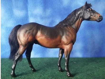
RES. CHAMPION SIMPLE REMAKE/ REPAINT/HAIR OR SCULPTED MANE/ TAIL: BR DANTON (HC)

Any Other Customization Not Listed Above (8): 1-Tiny Harper (AC), 2-Akasha (AC), 3-Attn Evildoers (AC), 4-Seventh Moon (AC), 5-Millennium Falcon (AC), 6-Jeddak's Rose (CH), 7-Ricatez (APo), 8-Razelle (APo)