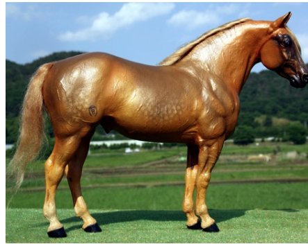
Red Hot Ryder , chestnut Quarter Horse stallion, CM by Tom Bainbridge in the 1980s: