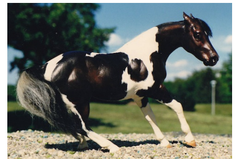
CHAMPION PATTERNED COLOR: THE AFRICAN SUN (AC)

Other Pinto Patterns (73): 1-Bloodbath Highway (CV), 2-Splasha Red (CM), 3-RM Heiwa (AC), 4-Starzans (AC), 5-Nao-to Nisei (AC), 6-Nine Across (AC), 7-Far Stars Burn (AC), 8-LBR Sagebrush Serenade (JG), 9-Restless Heart (JG), 10-Chirin's Bell (AC), HM-Paramount Precision (AC), Rustler Ridge (RN)