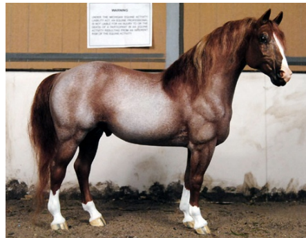
Red Rebel , red roan Standardbred stallion, CM by Carole Hale in 1991: