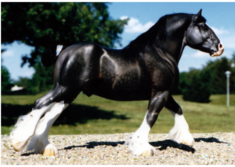
RESERVE CHAMPION BASE COLOR: BRIGANTE (AC)

Dapple Grey (56): 1-Asteroid Blues (AC), 2-Steeldust Lady (CM), 3-Smoke Bar Syndicate (CC), 4-Bittersweet (CV), 5-Jamil Mhuratt (CR), 6-Angel Queen (CV), 7-Sylver Crescent (CM), 8-Arahael (LB), 9-Phantom Lover (CV), 10-Loftus Jones (LB), HM-Diamond Silmaril (KW), Flirtation Device (AC)