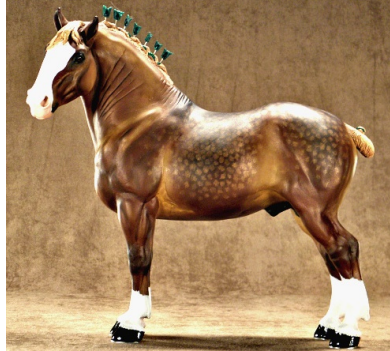
CHAMPION DRAFT BREED: LE COMTE DE MONTE CRISTO (CM)

1-Pippilotta-Elmar (JV), 2-Jake (JV), 3-KT Le Baron (CV), 4-TS Dragon Knight (MP), 5-DO Bessancour Moulin Rouge (JV), 6-Wish He Wood (KM), 7-TS Dragon Warrior (MP), 8-TS Druid Allanon (MP), 9-WV Heza KO (HC), 10-Wishful Thinking (KM)