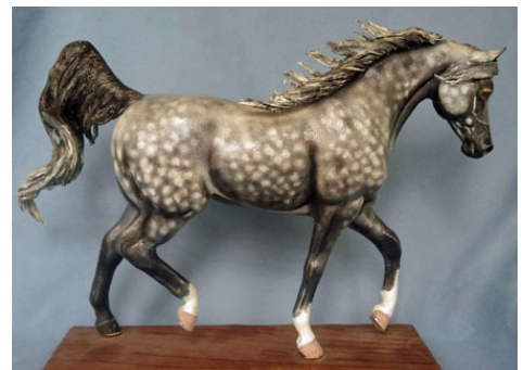
RES. CHAMPION MAJOR REMAKE/REPAINT/HAIR OR SCULPTED MANE/TAIL: ISILME (KW)

Extreme Remake & Repaint with Hair M/T: Trad. or Larger (115): 1-Bloodbath Highway (CV), 2-Quick Comet (AC), 3-Marney's Colorvision (AC), 4-Sophisticated Boom-Boom (CV), 5-Yellow Dancer (AC), 6-Warm Leatherette (AC), 7-Brigante (AC), 8-Freudian Slip (AC), 9-Slamdunk Diamond (AC), 10-Wolf Typhoon (AC), HM-Rocket Gibraltar (CV), Paramount Precision (AC), Powder River (AC)