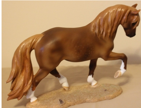
RESERVE CHAMPION REPAINT: MR. HANKY PANKY (LB)

Repaint w/Hair M/T: Trad. or Larger (40): 1-GGK Tiqatu (SN), 2-Tel El-Amaras Sheeba (SN), 3-Buckthorn (SM), 4-Brecon Apollo (KM), 5-Gateado Mancho (AC), 6-TS Autumn Dancer (MP), 7-Golden Malicious (SM), 8-TS Squall Line (MP), 9-Parklane Oystercatcher (JV), 10-PR Eldorado Spanish Rose (JV)