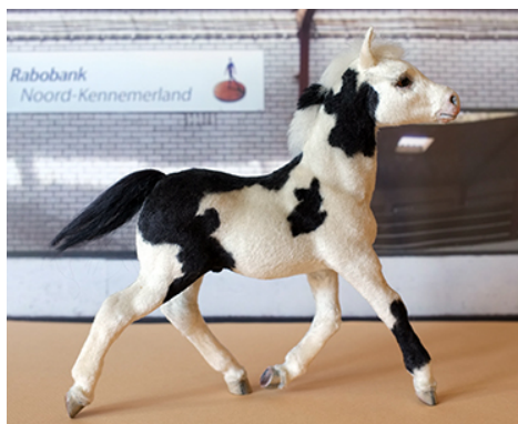
1990s WORKMANSHIP DIVISION OVERALL CHAMPION: MARS FLASH (AC)

[pictured second from top in next column]