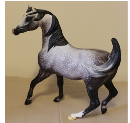
RESERVE CHAMPION REPAINT: ARAHAEL (LB)

Repaint with Hair M/T: Trad. or Larger (58): 1-Mon'Nafa Rani (CR), 2-Phantom Lover (CV), 3-Amano Jack (CV), 4-Smoke Bar Syndicate (CC), 5-The Midnight Flasher MB (CM), 6-LBR Sagebrush Serenade (JG), 7-Diamond Lollapaloosa (JV), 8-Sadamebius (AC), 9-Iron Butterfly (AC), 10-Southern Cross (CM), HM-Fiesta Jones (LB)