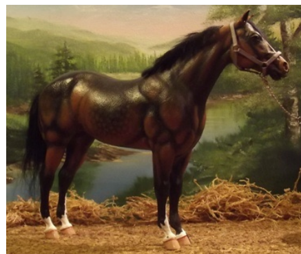
Skippa Tomacina , bay Quarter Horse mare, CM by Tom Bainbridge in the 1990s: Summer 2017