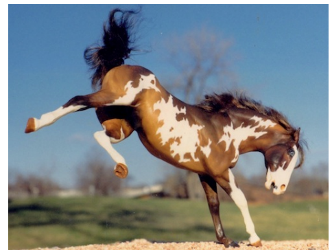
RESERVE CHAMPION PATTERNED COLOR: BLOODBATH HIGHWAY (CV)

Longear/Exotic (5): 1-Belle Kabong (AC), 2-Ironwood Glenn (SSt), 3-Pam-mule-a (KW), 4-Imagine That (SR), 5-Gentleman John (BH)