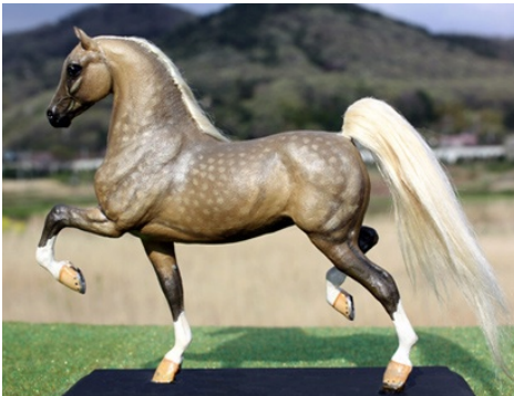
CHAMPION OTHER COLOR: PENNY DREADFUL (AC)

Fantasy Color (4): 1-Carosel (HC), 2-Rheanth (AC), 3-Aquarion (AC), 4-Phantom F Harlock (CV)