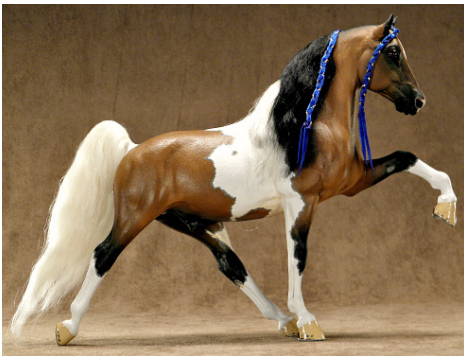
CHAMPION GAITED BREED: RM TWO-TONE STARBURST (CM)

Other Pure or Mixed Gaited Breed (9): 1-LBR Albuquerque (JG), 2-Foxy Moonshine (CM), 3-Misty Three-Kay (AC), 4-Sparkling Chablis Z (CM), 5-Ima Travelin' Man (CM), 6-TS Galilean Dragoness (MP), 7-Thumbs Up (HC), 8-TS Autumn Nor'easter (MP), 9-Glitters Like Gold (JV)