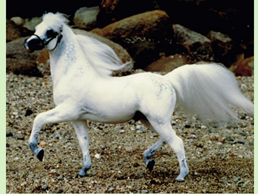
Mistaanez 40 Years Old!

(Have one created in 1960, 1965, 1970, 1975, 1980, 1985, 1990, or 1995? Get it into the Birthday Barn spotlight by e-mailing its photo and info to our Gmail address below!)