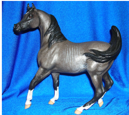
CHAMPION FLOCKED/OTHER CUSTOM: RM MIRO (CV)

Monkey Doodle Doo (CV), 5-Antara Apalonia (LB), 6-Street Singer Blues (HC), 7-Ysengrin (AC), 8-Goodbye Blue Monday (CV), 9-Carosel (HC), 10-*Ardiente (CH)