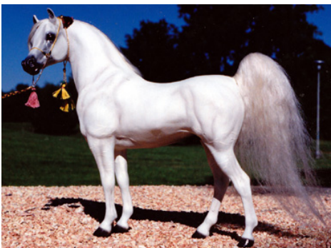
RESERVE CHAMPION LIGHT BREED: RAS ZEN AMAKO (AC)

Thoroughbred (22): 1-Temple Lord (SN), 2-Master Derby (AC), 3-Tetrasina (KW), 4-Half A Shadow (SN), 5-Claudia (SN), 6-DA Ben Macdui (JV), 7-KA Flight of Fancy