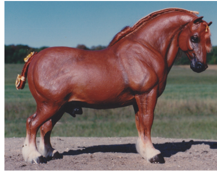
Galient , chestnut Suffolk Punch stallion, CM by Julie Froelich in 1989: