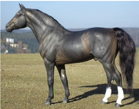
CHAMPION SPORT BREED: AMANTUS VS (SN)

Other Pure or Mix Sport Breeds (24): 1-Fiesta Time (SSSt), 2-PR Rosie O'Grady (JV), 3-Mickey Scymon (AC), 4-PHF Modesty Blaise (JV), 5-San Louie Obispo (AC), 6-Mr Darcy (SN), 7-Heinder-90 (CV), 8-PR Murphy Brown (JV), 9-Parklane Oystercatcher (JV), 10-Kamtara Colorado Autumn (JV)