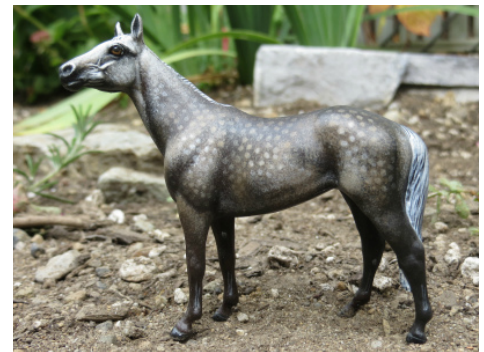
RES. CHAMPION SPORT: WINDS OF CHANGE (CH)

Paso Fino/Peruvian Paso (1): 1-Trigger Mortis (AC)