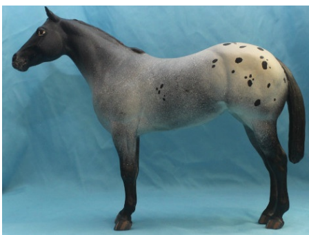
RESERVE CHAMPION STOCK BREED: AZURE LADY (SSSt)

Arabian (24): 1-Sasaki (AC), 2-*The Raisuli (CH), 3-*Quest (AC), 4-Andro Umeda (SM), 5-*Kara Zayim (AC), 6-Ancalime (KW), 7-Fi-