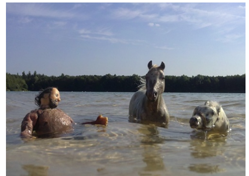
Scenes: Digital & 35mm Photo (14): 1-LBR Acadie, LBR Zeke & Dan bathing in lake (JG), 2-LBR Acadie: Mobile blacksmith (JG), 3-Desert Rose & Rock Ridge (& Twister Hancock in trailer) waiting for the western event (JG), 4-LBR Sunkawakan: Morning fog (JG), 5-LBR Acadie & Desert Dun: Frozen lake (JG), 6-LBR Tjorben: Autumn 1996 (JG), 7-Alamitos Ridge: Ride with Jace (RN), 8-LBR The Pinkeyed Stallion: Frozen prairie (RN), 9-Bluegrass Freckles: Cow work (RN), 10-LBR The Pinkeyed Stallion: Winter prairie (RN)