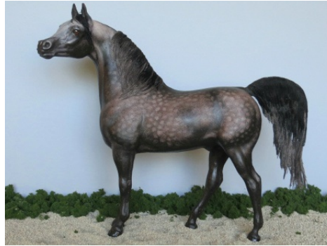
RES. CHAMPION MAJOR REMAKE/ REPAINT/HAIR OR SCULPTED M/T: *THE RAISULI (CH)