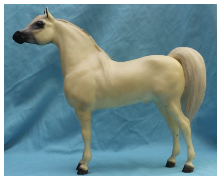
RESERVE CHAMPION CUSTOM W/FACTORY PAINT: WIZARDS VALE CONSTELLATION (SSt)

Repaint: Trad. or Larger (17): 1-Andro Umeda (SM), 2-Tejas Treasure (VM), 3-Carnival King (LB), 4-Follow The Moonlight (AC), 5-Hi Ho Hastings (LB), 6-Poco Graybar (LB), 7-Azure Lady (SSt), 8-Trig-ger Mortis (AC), 9-Sheneyn Alar (CH), 10-*Rebel Bint Sahra (CH)