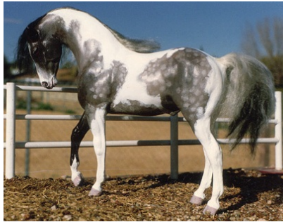
GGK Tiqatu , grey Arabian mare, CM by Maren Landschof in 1991: