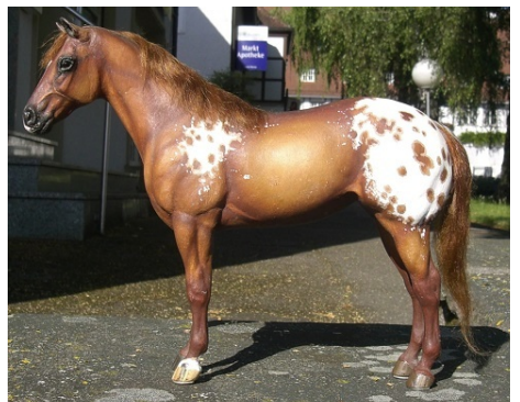
RESERVE CHAMPION STOCK BREED: GOJAKI (RN)

Arabian (65): 1-RAS Zen Amako (AC), 2-Moonlight Cocktail (CV), 3-GGK Tiqatu (SN), 4-LBR Rashasha (RN), 5-LJJ Royal Fire (KM), 6-Ahvaz Zeenat (SN), 7-*Enyaa (CV), 8-Ahvaz Shyrhah (BH),