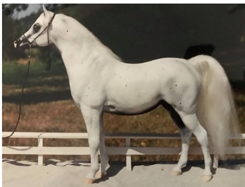
Mares & Geldings (18): 1-Wahaana (SN), 2-Lonesome Dove (CM), 3-DQ Shiaway Jetta (CM), 4-Nayef (SN), 5-Sweet William J (CM), 6-Ar Tayet (SN), 7-Witchita Rock (CM), 8-Sun's Only For You (SN), 9-Mountain Knight (CC), 10-Sherwood Peacock (CM)