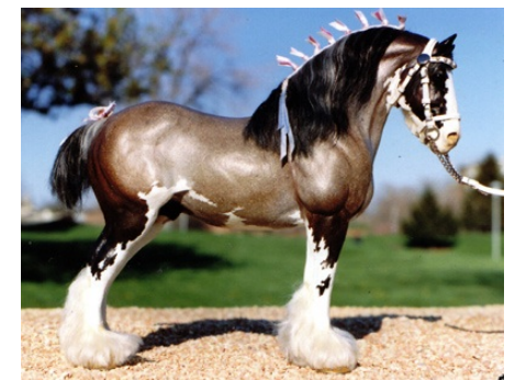
RESERVE CHAMPION DRAFT BREED: THUNDER IN PARADISE (AC)

American Pony (26): 1-Penny Dreadful (AC), 2-RM The Toy Wonder (CV), 3-Vanye (AC), 4-Zip's Silver Lining (CM), 5-Marty (SSt), 6-Go Varian (AC), 7-Confederate Gray (LB), 8-21st Century Boy (KM), 9-Indigo Eyes (AC), 10-BBG's Silver Ghost (CM), HM-Firefly (CV)