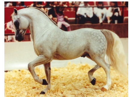
Siglavý Seiko , grey Lipizzan stallion, CM by Julie Froelich in 1992: Winter 2017