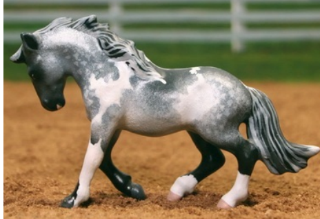
CHAMPION REPAINT: MCCALL'S BLUE CAT (KM)

Repaint: Smaller than Classic (32): 1-McCall's Blue Cat (KM), 2-Koncarlaet Leona (CM), 3-Captain's Flashy Jet (KM), 4-Blackberry Lane Notorious (SR), 5-Snookie (HC), 6-Delta Don (HC), 7-Oingo Boingo (HC), 8-Tootsie (HC), 9-Irock (SR), 10-Hello Dolly (HC)