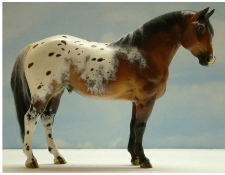
CHAMPION SIMPLE REMAKE/REPAINT/HAIR OR SCULPTED MANE/TAIL: MURPHY'S LAW (APo)

Simple Remake & Repaint w/Non-Hair Mane/Tail: Smaller than Classic (2): 1-Not Now Ni-san (AC), 2-Precision (CH)