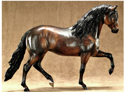
CHAMPION SPANISH BREED: MARQUESA (CM)

Other Pure or Mixed Spanish Breed (10): 1-Siglavy Seiko (CV), 2-KT Danza De Oura (CM), 3-Malegena (CM), 4-RM Sophiia (CV), 5-Lucullian (HC), 6-Pluto Estaria (BA), 7-Encaje (SSSt), 8-Gateado Mancho (AC), 9-Estela (VM), 10-Warlock (APa)