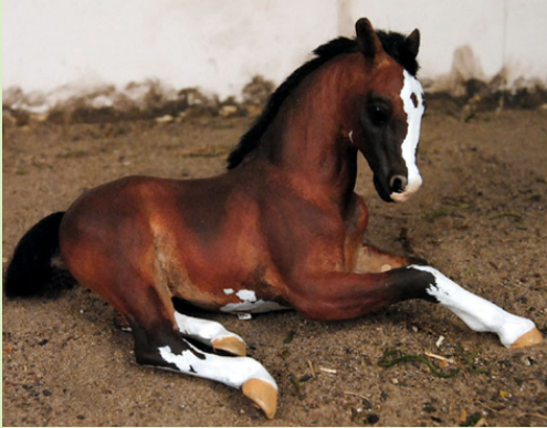
Plastique 25 Years Old!

CM by Sue Sudekum in 1995 Owned by Sue Sudekum