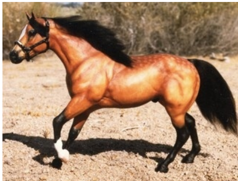
Stallions (5): 1-Gold Dust (CC), 2-Ar Sayyed (SN), 3-Scimitar's Ebony Flame (CM), 4-Sun's Oh Connor (SN), 5-Ebony & Ivory (CM)

Gone But Not Forgotten: Vintage customs that no longer exist