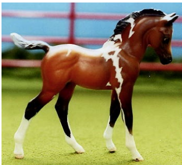
RESERVE CHAMPION CUSTOM WITH FACTORY PAINT: FAIRUZA (APo)

Repaint: Traditional or Larger (23): 1-Mr. Hanky Panky (LB), 2-Asuka Ryo (AC), 3-Burning Memory (CV), 4-Rodanheisler (CV), 5-Harlock (AC), 6-Shine On Harvest Moon (APa), 7-Mystic Pumpkin (HC), 8-Pearl Essence (CM), 9-Sparkling Chablis Z (CM), 10-Llaqtaymanta (SN)