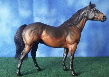
CHAMPION BASE COLOR: BR DANTON (HC)

Black (2): 1-*Kara Zayim (AC), 2-Groucho (BH)