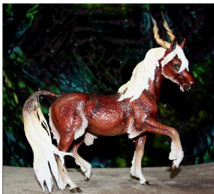
RESERVE CHAMPION EXTREME REMAKE/REPAINT/HAIR OR SCULPTED M/T: HIKAZE (CV)