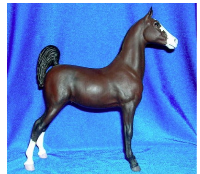
RES. CHAMPION FOAL: WOODLAND GYPSY (CV)

1960s/'70s BREED DIV. OVERALL CHAMPION: SASAKI (AC)