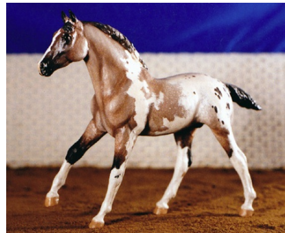
RES. CHAMP FLOCKED/OTHER CUSTOM: SHARAKK SEI (AC)

1980s WORKMANSHIP DIVISION OVERALL CHAMPION: BLOODBATH HIGHWAY (CV)