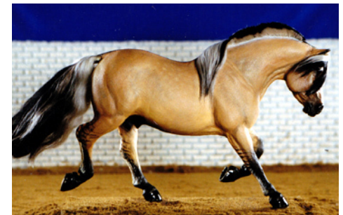
RESERVE CHAMPION PONY/MINI HORSE: RAGNAROK HYOGA (AC)

Longear (13): 1-MN Elwood Blues (RN), 2-Rebel Yell (RN), 3-DA Bardigano Honest John (JV), 4-123 (HC), 5-Fancy Feather Too (AC), 6-Sunshine's Beebop (CV), 7-Rhubarb Babe (AC), 8-Josephine (HC), 9-Tulpe (HC), 10-Rosalita (JG)