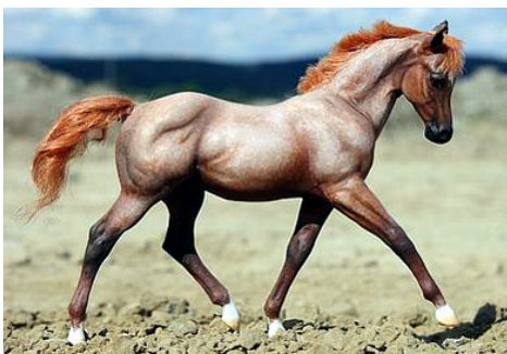
CHAMP FOAL: WITHOUT A DOUBT (AC)

Longear/Exotic/Fantasy Foal (7): 1-Waltzing Matilda II (HC), 2-Jewels (HC), 3-Samuel (BA), 4-Miss Moody (HC), 5-Jose (BA), 6-Roberto (BA), 7-Grits (BH)