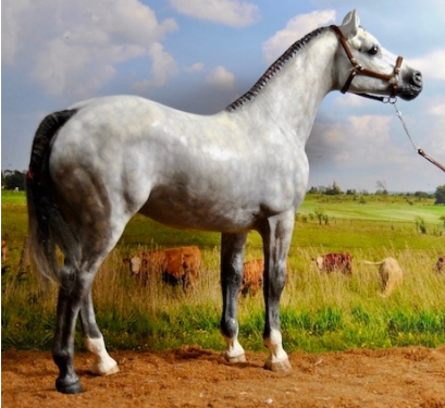
Penny Arcade , grey Thoroughbred mare, CM by Beth Peart in 1975: