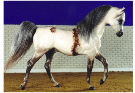
RES. CHAMPION EXTREME REMAKE/ REPAINT/HAIR OR SCULPTED MANE/ TAIL: MUSTAFA BEY (CV)

Flocked w/Haired or Other Non-Flocked Mane/Tail (1): 1-Tug Hill By Request (CM)