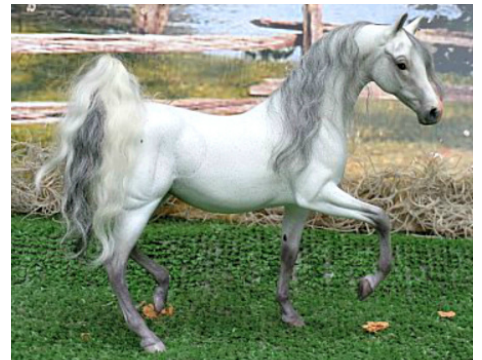
RESERVE CHAMPION REPAINT/HAIR OR SCULPTED MANE/TAIL: AHVAZ GAZIRA (BH)

Simple Remake & Repaint w/Hair M/T: Traditional or Larger (73): 1-Amantus VS (SN), 2-Walad (SN), 3-PR Rosie O'Grady (JV), 4-PR Monstella Storming Home (JV), 5-Impressive Heart (JG), 6-Rattlesnake Shake (AC), 7-Mona Lisa Overdrive (CV), 8-LJ Heartlikeawheel (AC), 9-RM Two-Tone Starburst (CM), 10-D.O. Miz Coppertone (RN), HM-LJ Dream of Jackson (CV)