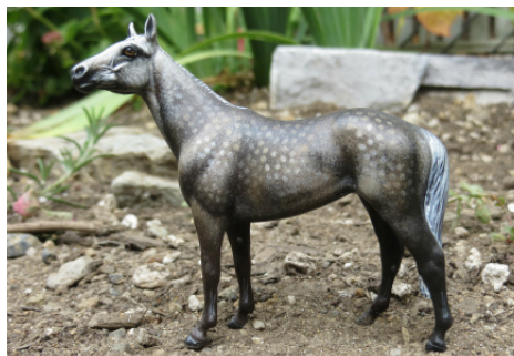
CHAMPION REPAINT: WINDS OF CHANGE (CH)

Repaint: Smaller than Classic Size (4): 1-Winds Of Change (CH), 2-Starship Phoenix (AC), 3-Pick Me A Winner (APa), 4-Rihanna (APo)