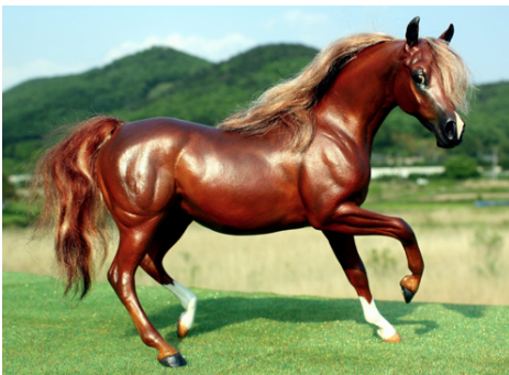
RES. CHAMPION EXTREME REMAKE/REPAINT/HAIR OR SCULPTED M/T: SAFARI EYES (CV)

Flocked with Flocked M/T and Remade & Flocked with Flocked M/T: no entries