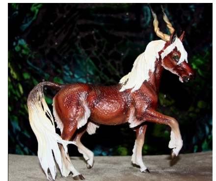
CHAMPION LONGEAR/EXOTIC/FANTASY: HIKAZE (CV)

Fantasy Equine (3): 1-Hikaze (CV), 2-TS Ramoth Of Riell (MP), 3-TS Trueheart (HC)