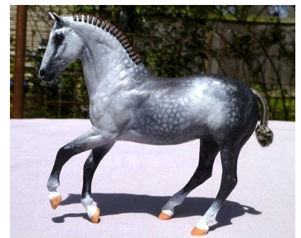
CHAMPION SPORT BREED: BITTERSWEET (CV)

Other Pure or Mixed Sport Breed (11): 1-Blank Stare (SR), 2-DQ Konociti's Jet (CV), 3-The Mad Cookie (CV), 4-Sunshine's Hardcore Chocolate (AC), 5-After Thoughts (HC), 6-Heartlight (HC), 7-Ethereal Breezy V (BK), 8-Blood Music (CV), 9-TS Fire On The Mountain (MP), 10-Tug Hill By Design (CM)