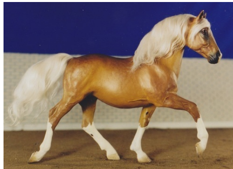
CHAMPION CREAM/DUN COLOR: VANYE (AC)

Dun/Grulla (14): 1-Miss Smokum Royal (CM), 2-Dakota Territory (JG), 3-KT Draublakken (JG), 4-Zona Lee (AC), 5-Seven S Rebel (LB), 6-Confederate Gray (LB), 7-J's Muddy Dun (JG), 8-Kid's Spanish Cash (CM), 9-No Doubt (CV), 10-Althea (SR)