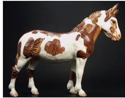
Shasta , chestnut striped Zony (zebra/pony) mare, CM by Michelle Belisle in 1992: Winter 2018