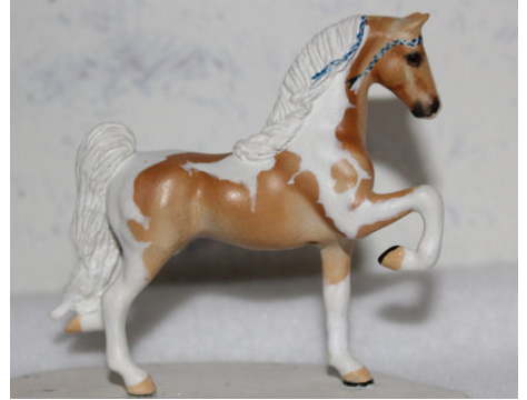
CHAMPION REPAINT/HAIR OR SCULPTED MANE/TAIL: MN JACKIE O (HC)

Repaint w/Non-Hair M/T: Smaller than Classic (2): 1-MN Jackie O (HC), 2-I'm Impressed (SN)