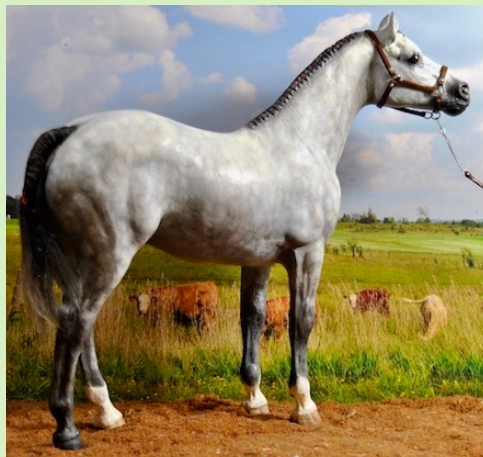
Penny Arcade 45 Years Old!