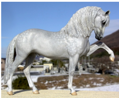
Follow The Moonlight , grey Andalusian stallion, CM by Nancy Strowger in 1979: