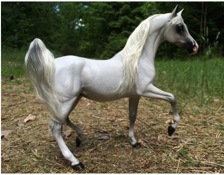
CHAMPION REPAINT/HAIR OR SCULPTED MANE/TAIL: SHANYA (SN)