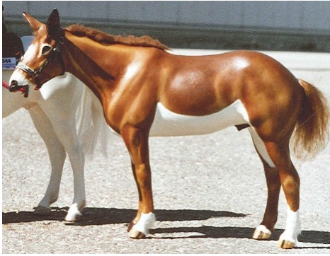
RES. CHAMPION LONGEAR/EXOTIC/ FANTASY: MN ELWOOD BLUES (RN)

Stock Breed Foal (15): 1-Without A Doubt (AC), 2-DA Pep C Max (CR), 3-MN Solitary Boy (HC), 4-Kitten On The Keys (APa), 5-PR Stolen Kisses (JV), 6-Wind Charm (JW), 7-LJ September Skye (JV), 8-Shonen Champion (CV), 9-PR Saskatoon Blues (JV), 10-LBR Zeke (JGa)