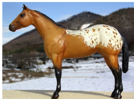
RES. CHAMPION CUSTOM W/FACTORY PAINT: BANG IPPONGI (AC)

Repaint: Trad. or Larger (36): 1-Arahael (LB), 2- Such Are Promises (AC), 3-Rhapsody Redford (LB), 4-Loftus Jones (LB), 5-Seven S Rebel (LB), 6-Avalanche (CV), 7-Red Tribution (AC), 8-Love Letters (LB), 9-Nyx (AC), 10-Trueno Azul (CM)