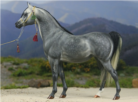
RES. CHAMPION REPAINT/HAIR OR SCULPTED M/T: MON'NAFA RANI (CR)

Simple Remake & Repaint w/Hair Mane/Tail: Trad, or Larger (80): 1-Murphy's Law (APo), 2-Asteroid Blues (AC), 3-Red Hot Ryder (SM), 4-Apache Red Chief (CM), 5-Splasha Red (CM), 6-Justy (AC), 7-LBR Tjorben (JG), 8-Steeldust Lady (CM), 9-Naoto Nisei (AC), 10-Diamond Silmaril (KW)