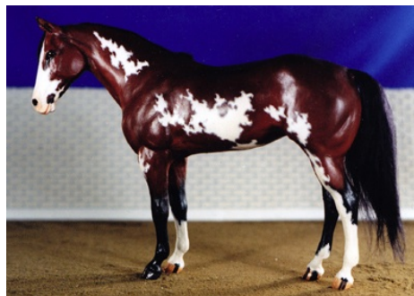
RES. CHAMPION STOCK BREED: FAR STARS BURN (AC)

Arabian (67): 1-Jamil Mhuratt (CR), 2-Mon'Nafa Rani (CR), 3-Shanya (SN), 4-Safari Eyes (CV), 5-Sandrock (AC), 6-Amarna Bint Morafic (CV), 7-TS Elegant Gypsy (MP), 8-Iphegenia (BH), 9-Isilme (KW), 10-En Fuego (CR), HM-Osiris (AC)