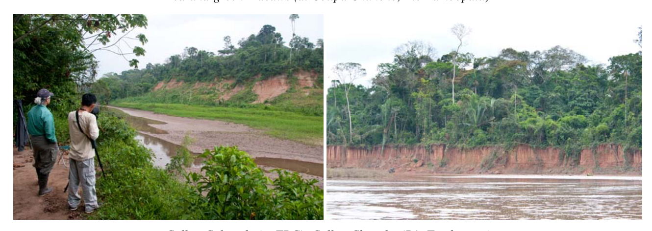
Collpa Colorado (at TRC); Collpa Chuncho (Río Tambopata)