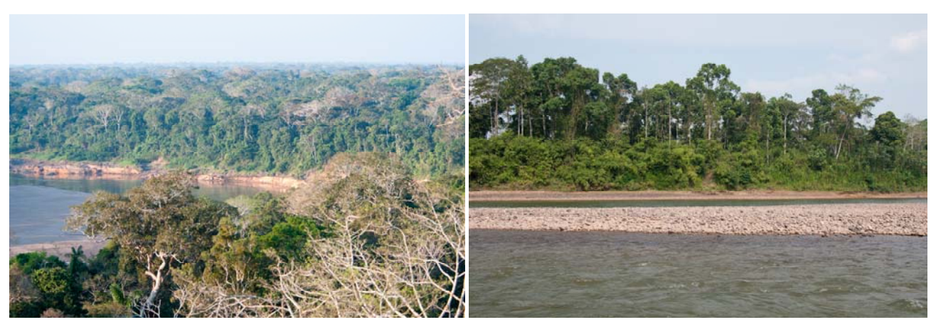
View of Río Tambopata from Posada Amazonas' Canopy Tower; Views along Río Tambopata near to TRC