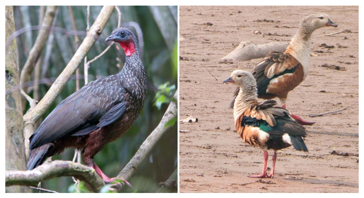
Spix's Guan (at TRC); Orinoco Goose (along Río Tambopata)