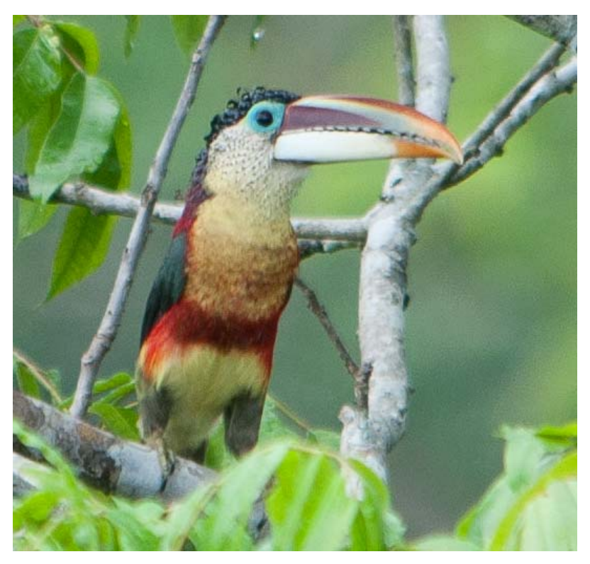
Curl-crested Araçari (at Refugio Amazonas)

The overall quality of the wilderness experience was excellent, with the superb setting enhanced by the professional guiding. The lodging was also just right. The simplicity (no hot water [except at Posada Amazonas], minimal electricity, shared facilities [at TRC only] and just a mosquito net but no windows separating the beds from the forest) was consistent with the remote locations, however the lodges were immaculately clean, offered excellent food, demonstrated environmentally sensitive practices and the staff were welcoming and helpful. TRC, being the smallest of the lodges, had a particularly remote and special atmosphere complete with an interesting mix of fellow visitors, guides and macaw researchers with whom to share dinner and a cold Cusqueña or Pisco Sour!