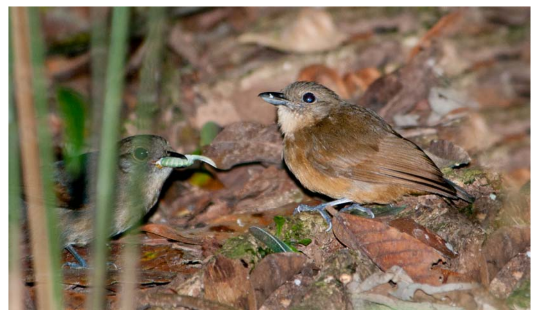
Dusky-throated Antshrike (female with juvenile) (at TRC)