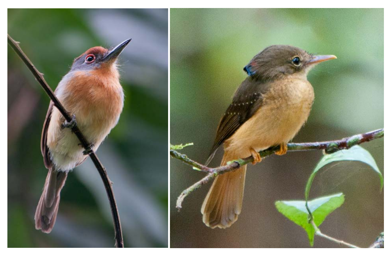
Rufous-capped Nunlet (at TRC); Royal Flycatcher (at Refugio Amazonas)