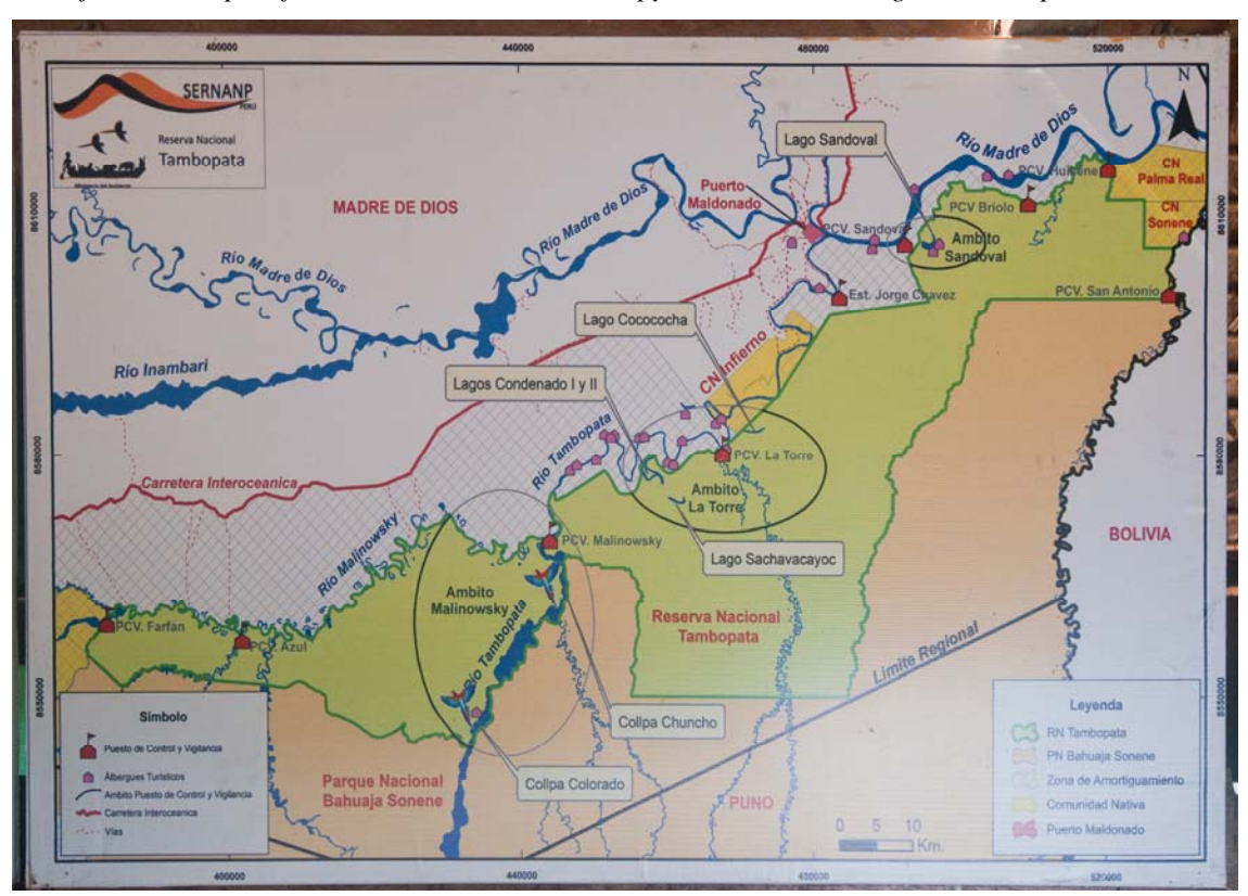
Regional map on display at the Puesto de Control 'La Torre'