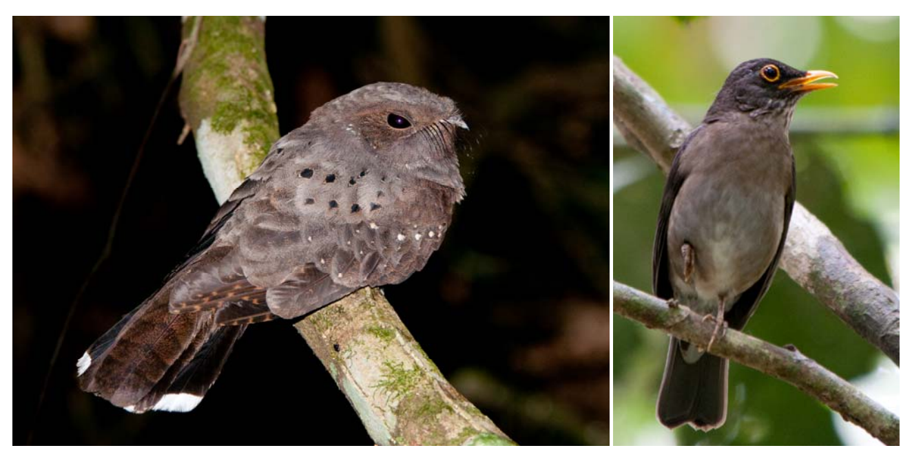
Ocellated Poorwill; Lawrence's Thrush (both at TRC)