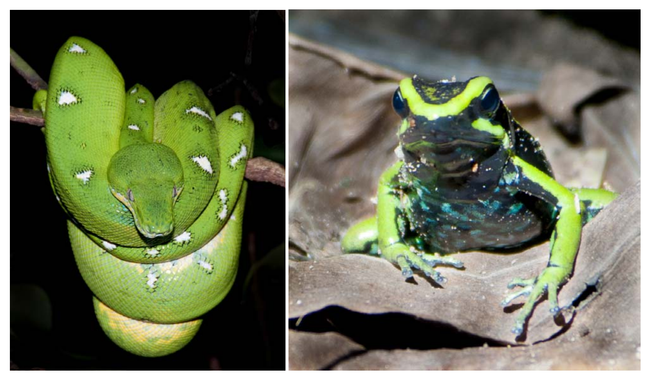
Emerald Tree Boa (at Refugio Amazonas); Poison Dart Frog (at TRC)