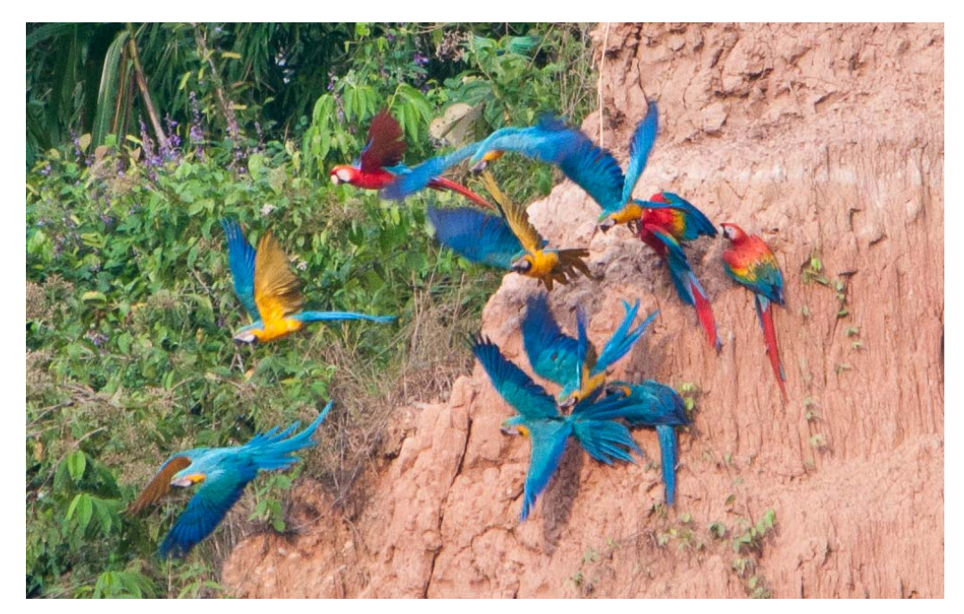
Blue-and-yellow Macaws and Scarlet Macaws (at Collpa Colorado, TRC)

Narrow-snouted Spectacled (White) Caiman Caiman crocodylus [TRC; RioT]: Several seen in various ponds, whilst a very large individual was seen showing off his teeth as he basked on a sand-bank upstream of Puesto de Control Malinowski.