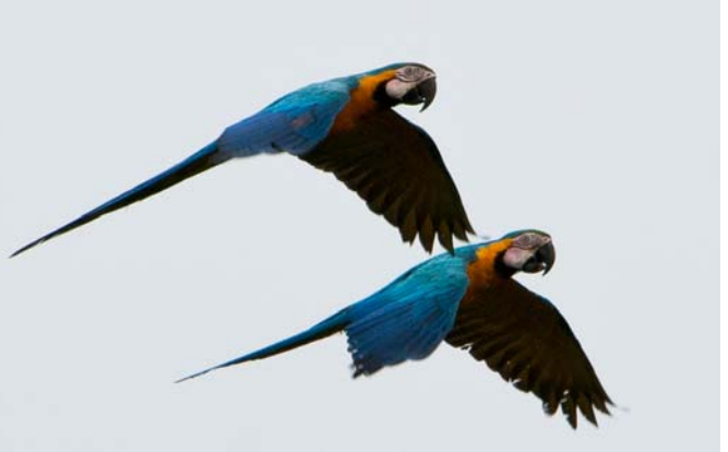
Scarlet and Blue-and-yellow Macaws; Blue-and-yellow Macaws (both at Collpa Colorado, TRC)