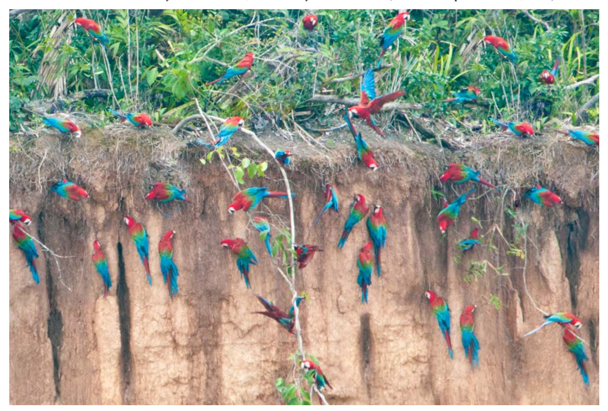
Red-and-green Macaws (at Collpa Chuncho, Río Tambopata)