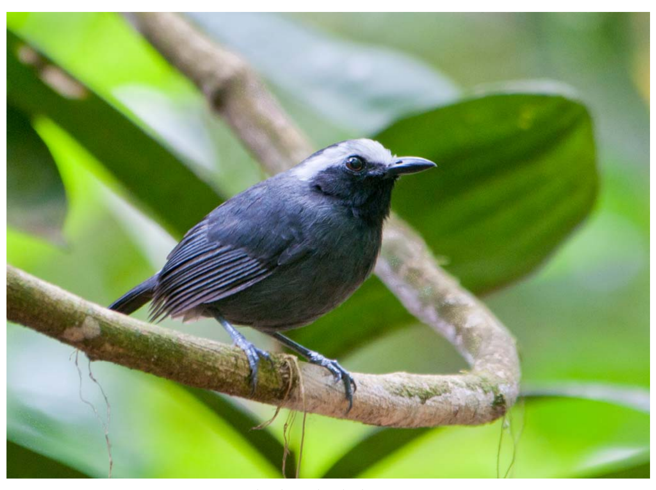
White-browed Antbird (at TRC)