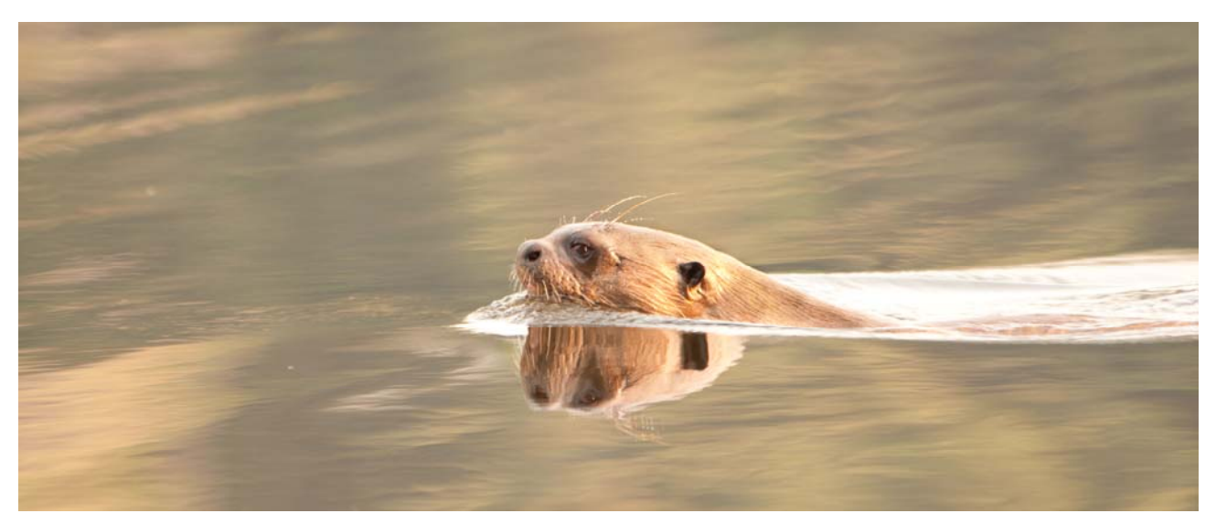
Giant Otter (at Tres Chimbadas)