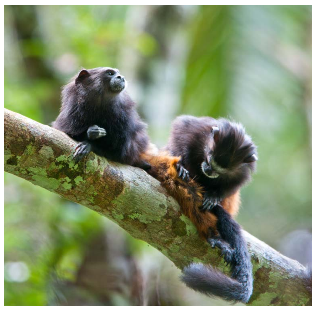
Saddle-back Tamarins grooming (at Refugio Amazonas)