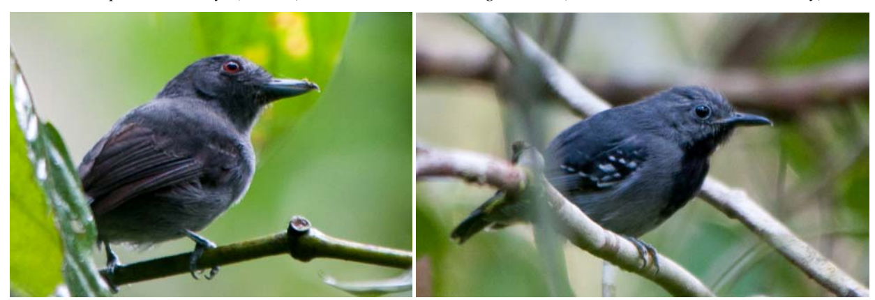
Plain-winged Antshrike (at TRC); Long-winged Antwren (at Refugio Amazonas)