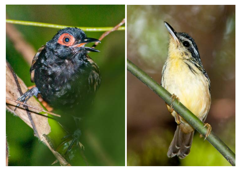
Black-spotted Bare-Eye (at TRC); Yellow-bellied Warbling-Antbird (at Puesto de Control Malinowsky)