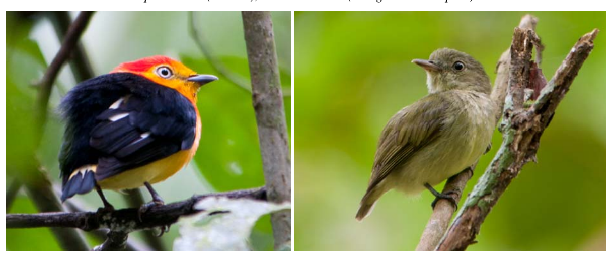
Band-tailed Manakin; Pygmy Tyrant-Manakin (both at TRC)