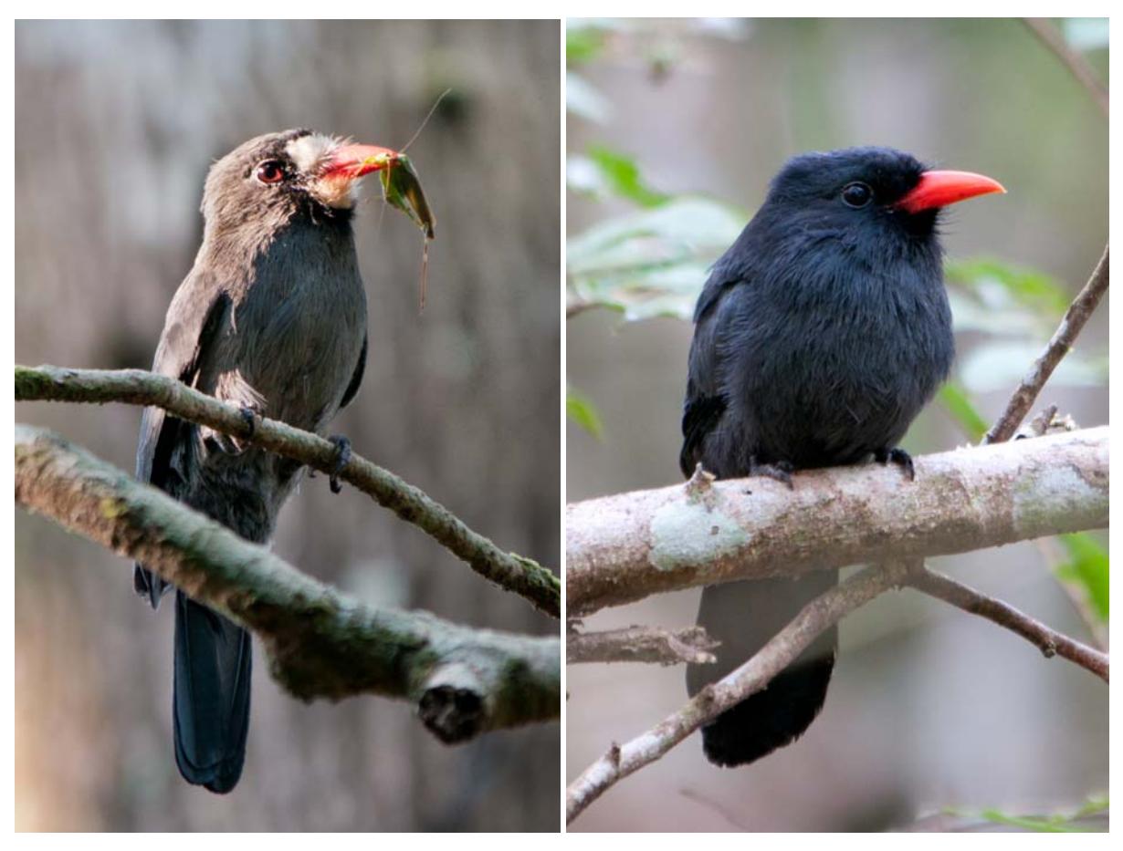
White-fronted\ Nunbird\ (at\ Posada\ Amazonas);\ Black-fronted\ Nunbird\ (at\ TRC)