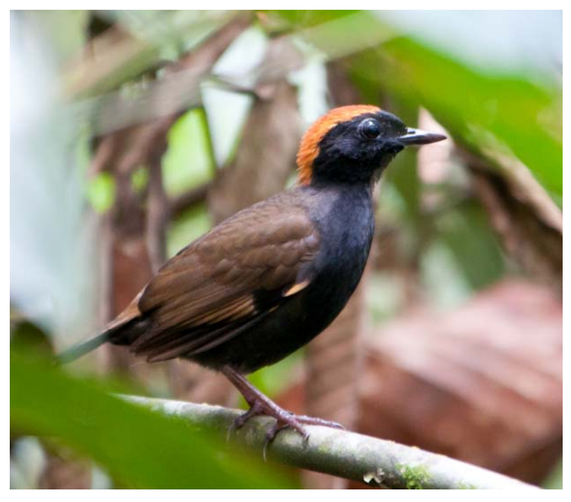
Rufous-capped Antthrush (at Refugio Amazonas)