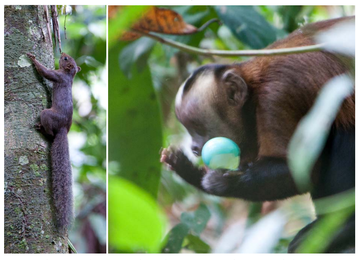
Bolivian Squirrel; Brown Capuchin monkey eating a presumed Tinamou egg (both at TRC)