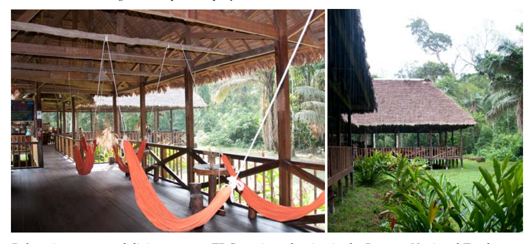
Relaxation space and dining room at TRC, set in a clearing in the Reserva Nacional Tambopata