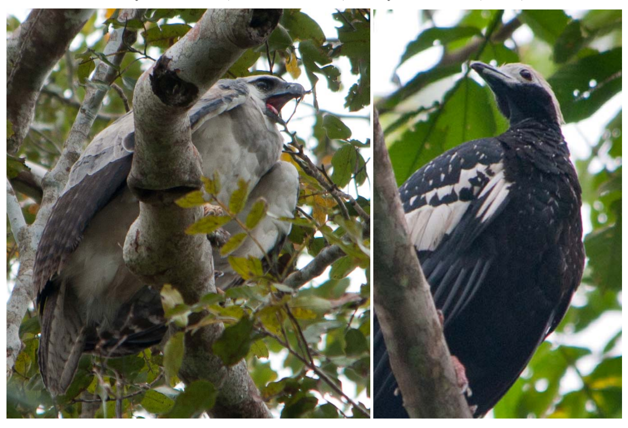
Immature Harpy Eagle (at Refugio Amazonas); Blue-throated Piping-Guan (at TRC)