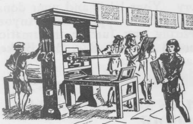
THE GUTENBERG PRINTING PRESS

"The grass withereth, the flower fadeth: but the word of our God shall stand forever." Isa. 40:8.