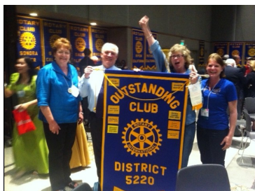
Let's do it again!