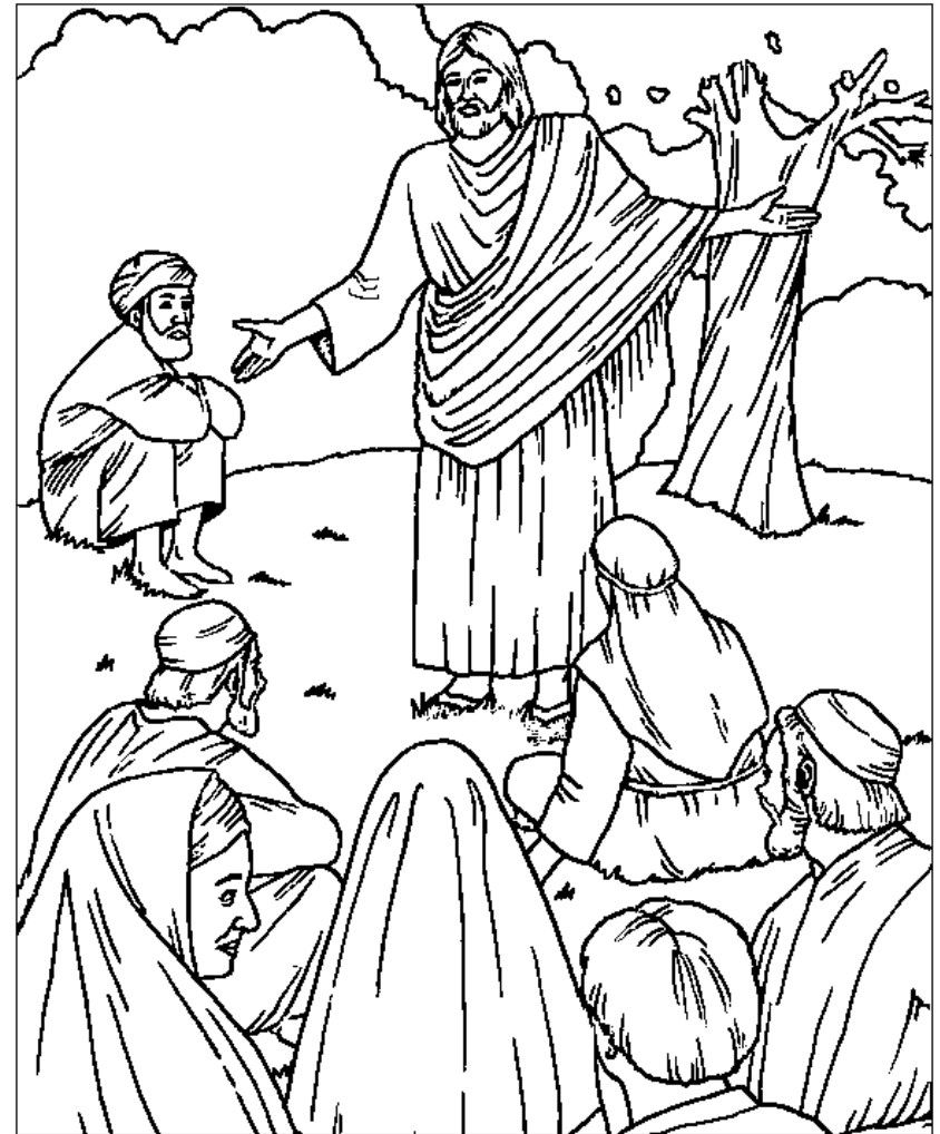
The Sermon on the Mount Matthew 5:1-12