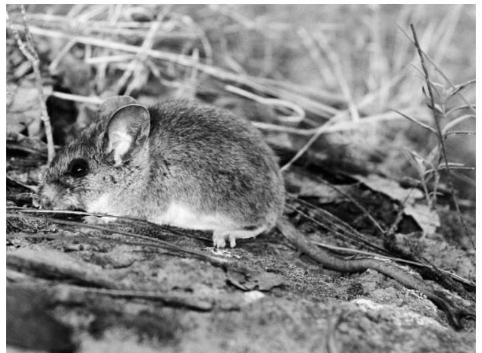
Fig. 1. —Adult male Peromyscus levipes from 7.9 km SW San Salvador el Seco (19°04'33.6"N and 97°41'11.1"W), Puebla, Mexico.

beatae and P. boylei ). When compared to P. boylei rowleyi , P. levipes can be distinguished by overall larger size, darker color, and more cinnamon dorsum. The following characteristics of P. levipes usually distinguish it from P. boylei rowleyi (Schmidly et al. 1988): ratio of greatest anterior width of nasal bone to posterior width is <1.9 ; ratio of greatest posterior width of nasal bone to length of nasal bone is <0.17 ; maxillofrontal suture is a continuous line