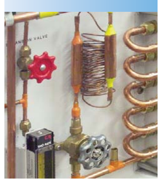
A/C, Refrigeration & Boilers

Covers fundamental information on all types of heating systems. Begins with the concept of heat energy, heat transfer, and temperature scales. Examines factors affecting human comfort. Introduces all types of heating equipment and its operation. Includes a lesson on combustion and thermal efficiency. Concludes with a lesson on duct systems.