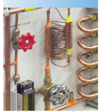
A/C, Refrigeration & Boilers