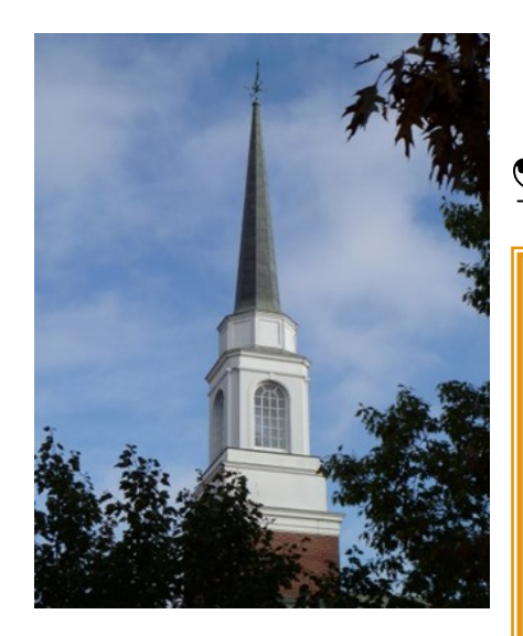
October 2023 Volume 68, No. 9