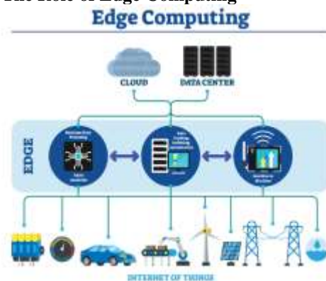
Figure 1; transformative solution within the IoT landscape