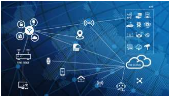
Figure 4; Rollout of 5G networks

As the field of edge computing for IoT continues to evolve, several emerging trends and research directions are shaping its future: